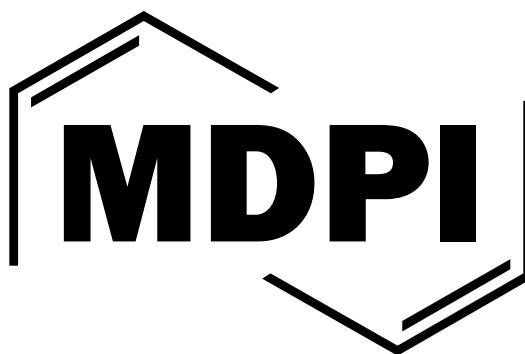
Figure 1. This is a figure. Schemes follow the same formatting.

All figures and tables should be cited in the main text as Figure 1, Table 1, etc.