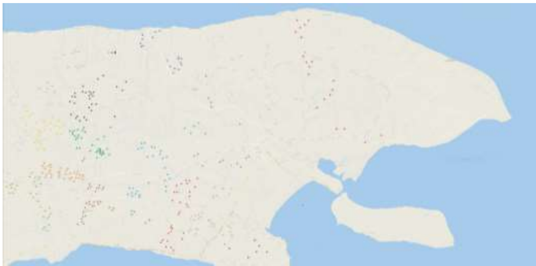
Figure 6. Result of clustering using p-median for farmer group in Sumenep.

sustainable ethanol production supply chain, facilitating consistent feedstock flow and maximizing the economic benefits for smallholder farmers. The data of visualized clustering of farmers group in Sumenep shown on Figure 6.