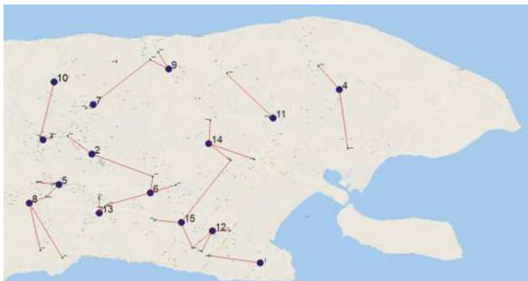
Figure 7. visualization of supply chain network from seed breeder to farmer group clustering in Sumenep.

robust and responsive agricultural supply chain for corn farmers. The result of supply chain between corn seed breeder to farmer group show on Figure 6.