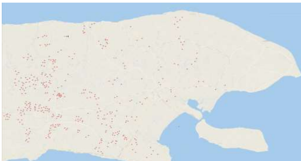
Figure 1. visualization of distribution farmer groups in Sumenep district.