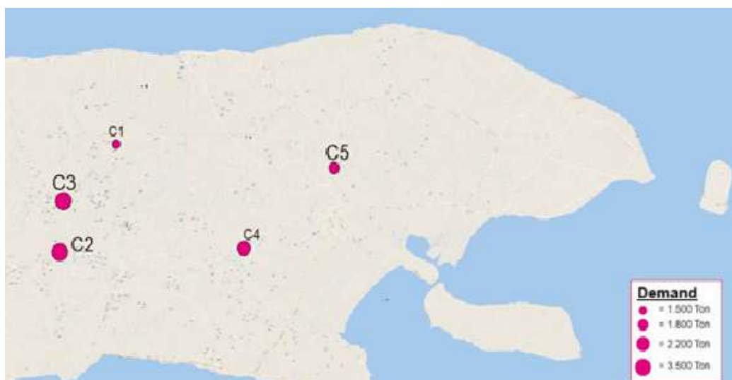
Figure 5. location of agricultural warehouse in Sumenep.