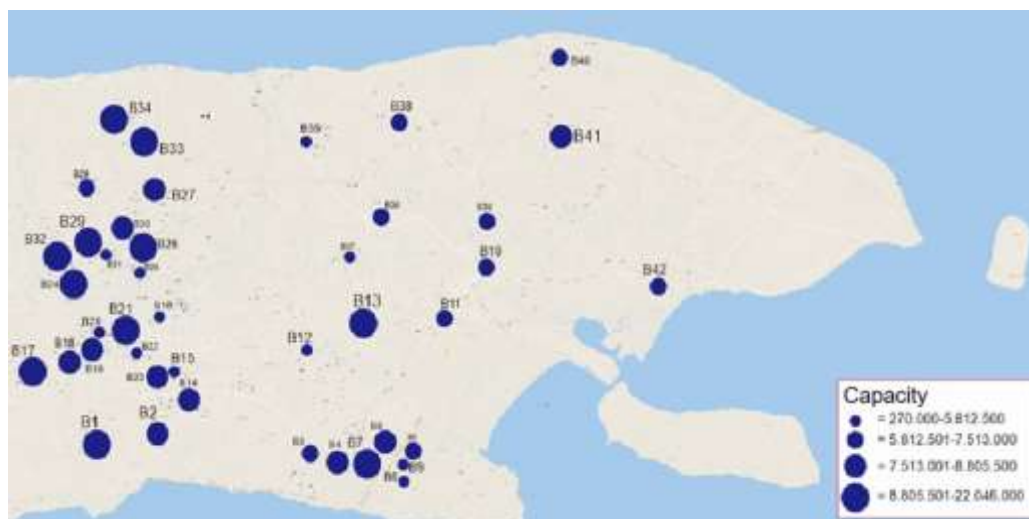
Figure 3. distribution of seed breeders in Sumenep district.

These fertilizer stores are trusted by the Sumenep district government to distribute subsidized fertilizer to farmers. The following is data on fertilizer stores that receive subsidized fertilizer in Sumenep district, as shown in Table 3.