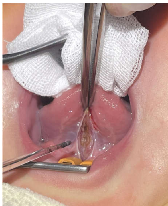
Figure 3. Intraoperative findings showing incision of the genioglossus muscle bundle (Before and after CGL).