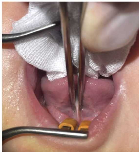
Figure 2. Intraoperative findings showing incision of the genioglossus muscle bundle (Before and after CGL).

CGL was performed on postnatal day 60 (the day after the initial consultation). The patient was placed in the supine position, and Xylocaine jelly (1 mg) was applied to the floor of the mouth for infiltration anesthesia. The lingual frenulum was incised using a diode laser, followed by exposure of the genioglossus muscle. A single layer of the genioglossus muscle bundle was incised ( Figure2.3 ).