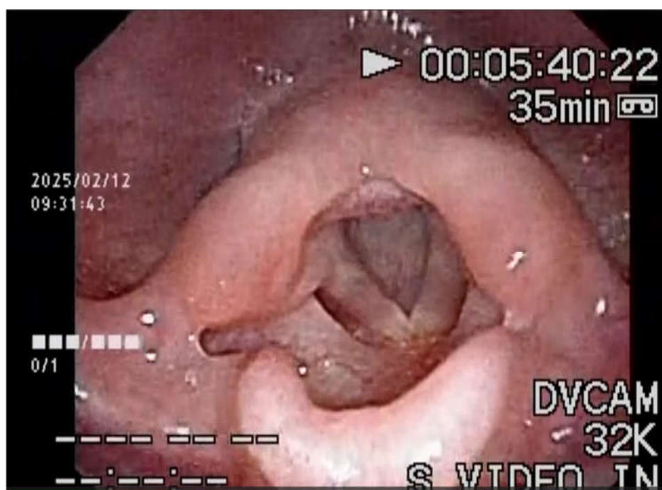
Figure 4. Flexible endoscopic laryngeal findings after CGL surgery.

At postoperative day 8, follow-up examination showed marked improvement. Facial coloration was normal, feeding difficulties resolved, cyanosis during crying disappeared, and SpO 2 remained stable at 97–100%. Flexible laryngoscopy demonstrated dramatic improvement, with complete resolution of epiglottic prolapse during inspiration ( Figure 4; Supplementary Video 2 ). Findings remained stable at one-month follow-up.