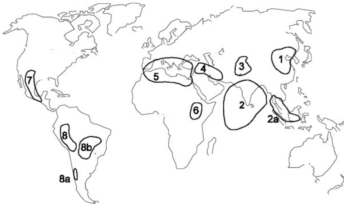
Figure 1. Vavilov Centers of Origin Fig. 1-Centers of origin of cultivated species, Vavilov (1926).

Figure 1: Vavilov Centers of Origin Fig. 1-Centers of origin of cultivated species, Vavilov (1926).