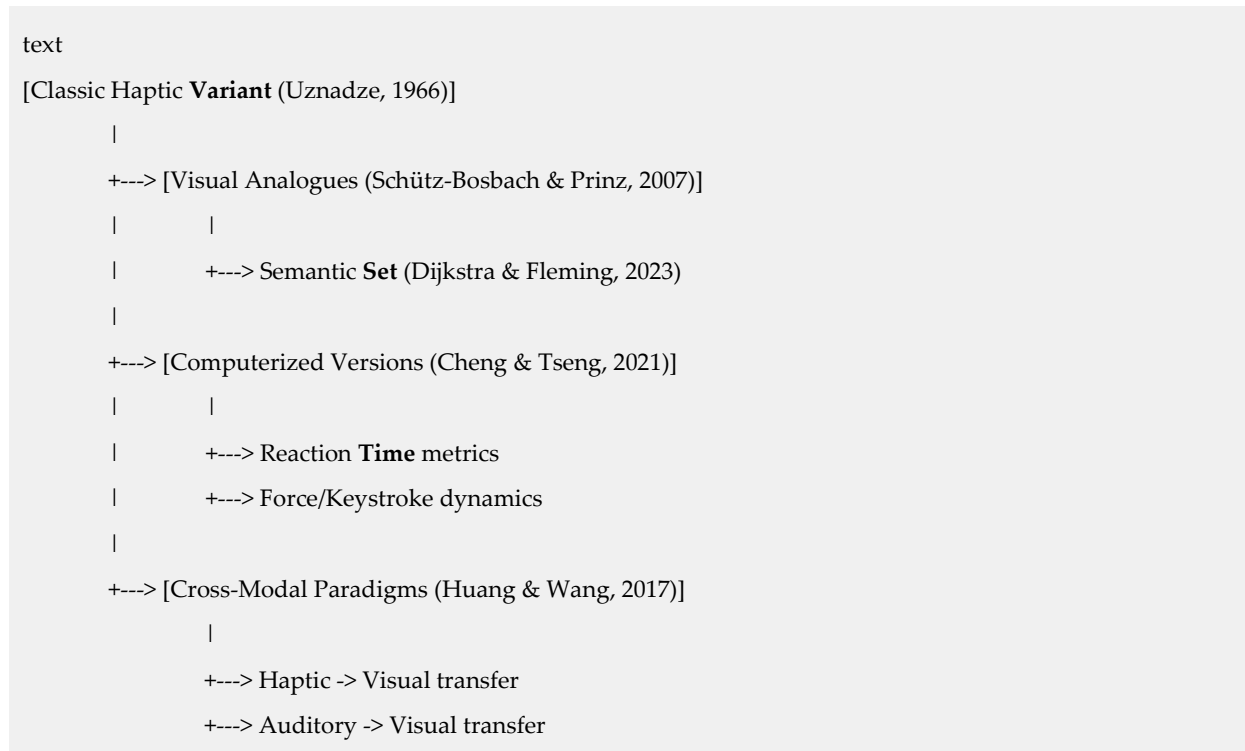
Figure 1. Evolution of the Uznadze Set Paradigm. A flow chart depicting the progression from the Classic Haptic Variant to Modern Modifications, with branches for Visual, Computerized, and Cross-Modal paradigms, listing key features and references for each.