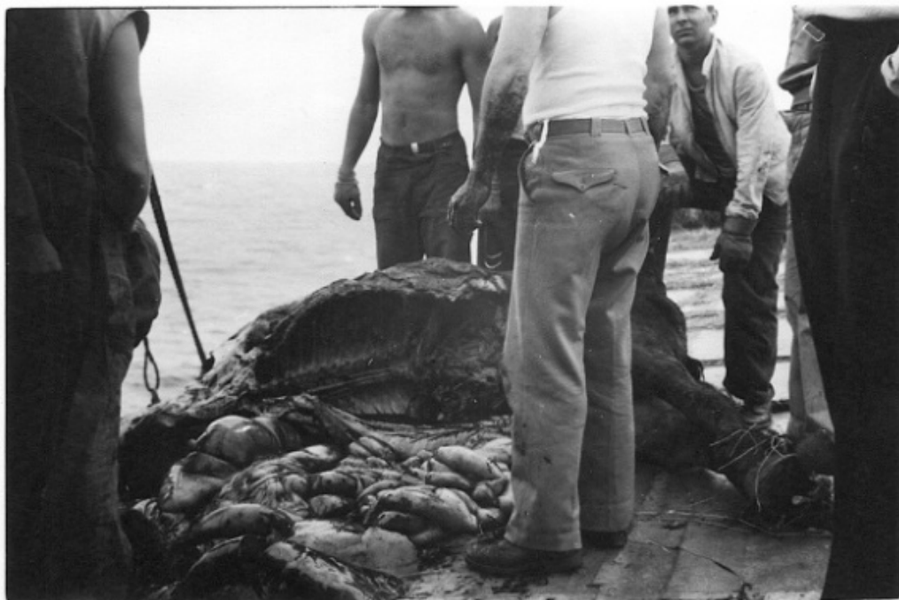
Figure 1. Autopsy on the S. S. Lindenwood Victory, summer 1946 Photo author: L. Dwight Farringer (Source: https://seagoingcowboysblog.wordpress.com/2021/03/12/unrra-livestock-trips-from-the-eyes-of-a-veterinarian/ ).

The unloading, examination and selection of animals at the end of the journey, in turn, posed a considerable logistical challenge for the post-war Polish veterinary service (Figure 2) [6,12,13,15]. About 50 horses and a similar number of cattle were estimated to remain from one transport for inpatient treatment. A total of 4688 out of 129,949 loaded horses died. Almost 17,658 horses passed through the clinics in Gdańsk, Gdynia and Sopot (a complex of Polish port cities), and 2618 died. These figures illustrate the magnitude of the problems veterinarians face [12,13,31]. Upon arrival in Poland, the animals had to undergo a process of quarantine and adaptation to the new conditions [6,12,15].