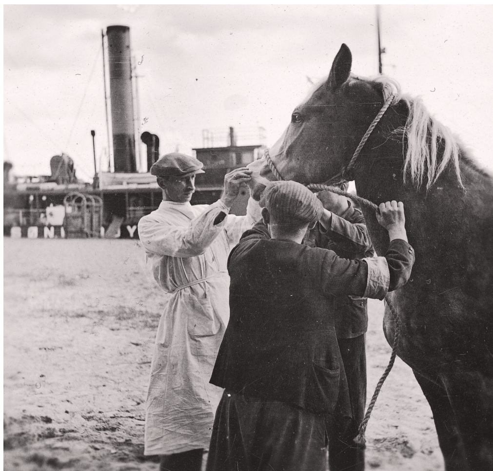
Figure 2. Preliminary veterinary inspection of horses delivered by UNRRA to the port of Gdansk. (photo: National Digital Archive).