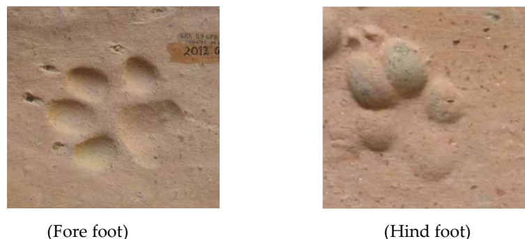
Figure 1. Dog Fore foot and Hind foot.

A similar method of measurement was applied to the recording of the cat footprints, although for cats, no claw marks are present. Length was from the farthest toe print to the end of the pad. Width was recorded medial to lateral across the greatest distance for the toes. Cat and dog prints differ in not only the lack of claw marks for the cats, but also by the shape of the paw print (Figure 2). Cat prints are more rounded. The negative space between the toes and pad are shaped differently with the cat having a more upside down “U” shape and the dog having a more upside down “V” shape [7].