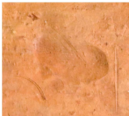
Figure 8. Possible human infant print on tile 2024.0780.

In the current study, there is one possible infant or young child print. However, the print is odd in that it seems too wide for the length and the arrangement of the toes is not as expected for a normal foot. Thus this identification is not definitive, but human is the most likely animal to have created this print. A possible big toe (hallux) and two other toes are visible. The three toes showing appear too large for an infant or young child. The toes are also at odd angles relative to the heel and metatarsophalangeal area (Figure 8). Perhaps someone pressed the foot of this child into the wet clay and rolled it somewhat to get a good impression resulting in the odd shape. The measurements are maximum length of 87 mm; width at toes is 51 mm; width at heel is 41 mm.