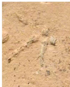
Figure 4. Bird footprint.

A few prints from birds were found on these tiles. These prints were rarely complete. The bird prints did not impress into the wet tile surface well. Measurements were taken of the overall length and width. Each toe was also measured. Bird feet often have four toes with the first toe to the rear and the other three toes pointing forward. Toes are numbered starting with the rear toe as I, then numbering the forward toes as II, III, and IV. Some birds also have a metacarpal pad (Figure 4). Claws are at the end of the toes for some birds and some birds have webbing between the toes. All these characteristics were recorded when present to aid in identifying the bird. Measurements and identification were completed following the methods in published sources [4,5].