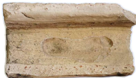
Figure 5. Human Footprint 1995.0172.