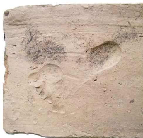
Figure 6. Human Footprint 2024.0308.

The current study includes three partial adult bare footprints. These prints include the front portion of one foot (Figure 7). This has all five toes and part of the ball of the foot and based on the overall size is likely an adult. Two other CBM fragments had what appeared to be the heels of a bare human foot. It is not clear why only the heel was present. Based on overall size, these were also likely made by an adult. Table 4 gives the measurements for the partial human bare footprints complete enough to measure. For 1996.0649, the metatarsophalangeal area is not complete and the width of 59 mm is not comparable to the measurement on number 7 in Table 3. The maximum heel widths of 2024.0727 (1 and 2) are complete and compare with the measurements of number 10 in Table 3. Based on these measurements, the size is lightly larger than the other measured prints but is within the size range of an adult female.