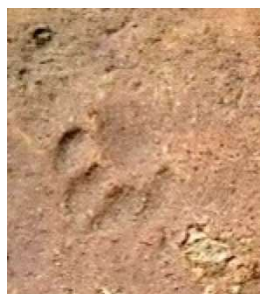
Figure 2. Cat footprint.

A similar method of measurement was applied to the recording of the cat footprints, although for cats, no claw marks are present. Length was from the farthest toe print to the end of the pad. Width was recorded medial to lateral across the greatest distance for the toes. Cat and dog prints differ in not only the lack of claw marks for the cats, but also by the shape of the paw print (Figure 2). Cat prints are more rounded. The negative space between the toes and pad are shaped differently with the cat having a more upside down “U” shape and the dog having a more upside down “V” shape [7].