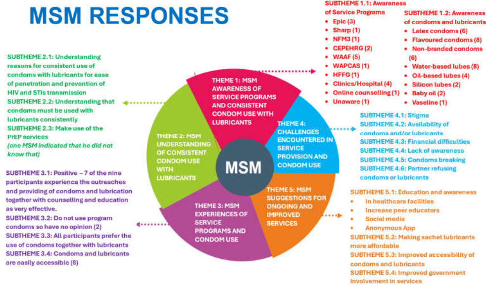
Figure 2. The MSM responses to interventions/programmes for consistent and correct use of condoms with condom-compatible lubricants.

Theme 1: MSM awareness of available services and consistent condom use with lubricants