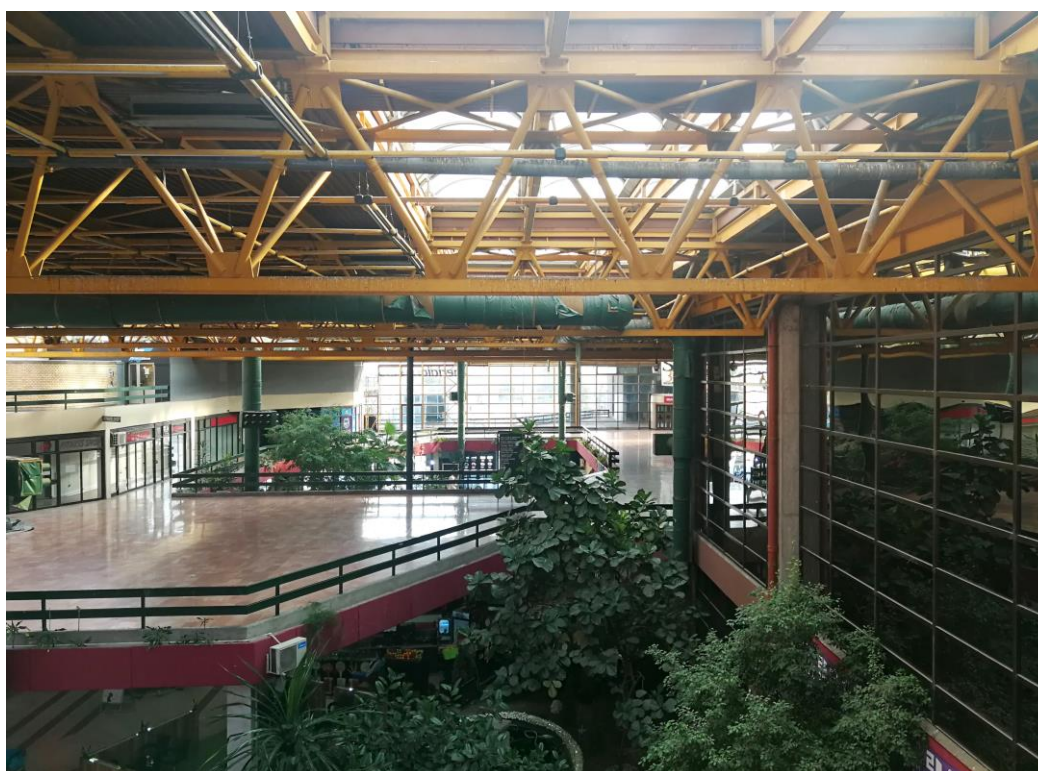
Figure 4. Main indoor public space on first floor between two houses, whose ambient is defined by rich indoor vegetation and daylight entering from skylights. Author: Bojan Stojković. Copyright 2021 Baza - Spatial Praxis Platform.

Figure 3. Spens' main multi-sport hall and event space, which, along with its ancillary functions, comprises the largest of the multiple 'houses' of this complex megastructure. Author: Maja Momirov. Copyright 2021 Baza - Spatial Praxis Platform.