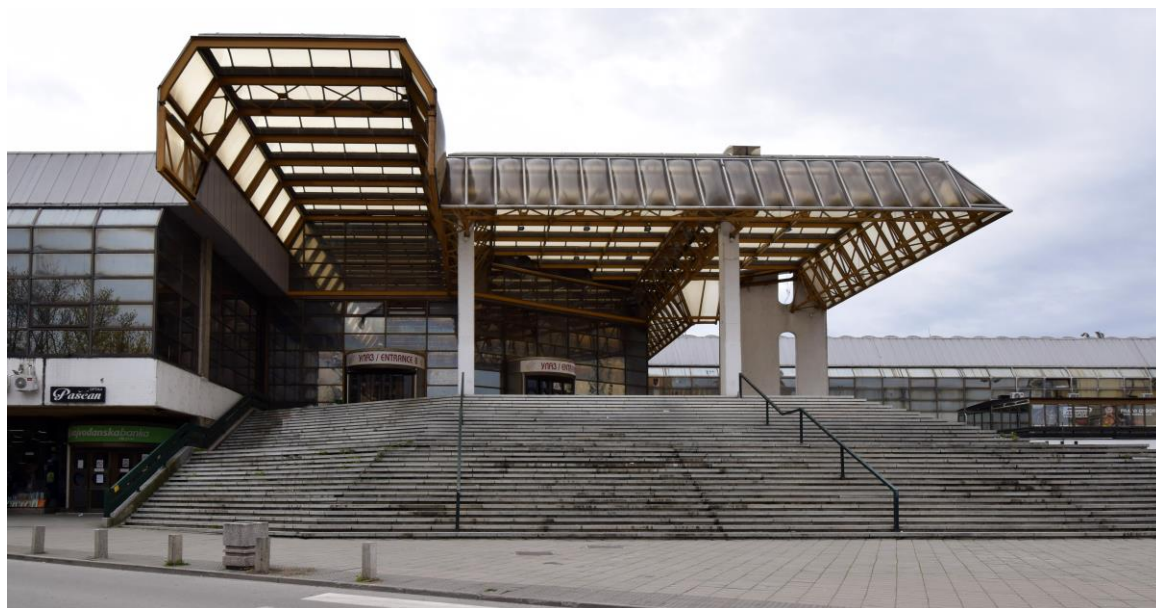
Figure 2. One of Spens' 6 major entrances characterised by large exterior stairs and distinctive polycarbonate and steel roof canopy. Author: Maja Momirov. Copyright 2021 Baza - Spatial Praxis Platform.