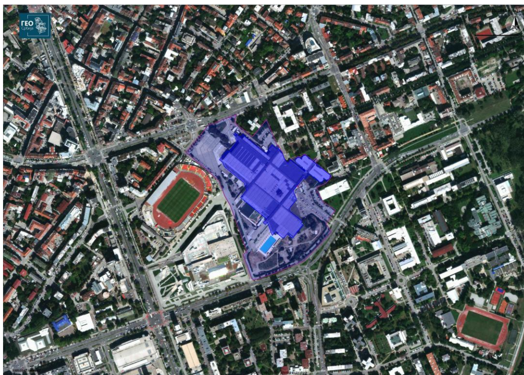
Figure 1. Digital orthophoto showing Spens in the wider urban matrix—central zone of Novi Sad, Serbia. Source: GeoSrbija, Republic Geodetic Authority of Serbia; annotation by authors.

The realisation of the Centre and its continued vitality—even through the country’s challenging transitional period, which saw many similar facilities decline—attest to the sound and sustainable foundations of the building itself. Spens’ spatial concept, its programmatic diversity, and the fact that it lies along the daily routes of the city’s residents have ensured its longevity, despite its current poor technical and technological condition. Its future, therefore, rests on the strengths of its design as an urban megastructure, characterised by several highly significant qualities: