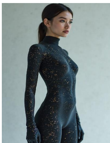
Figure 3. Phase change fabric.