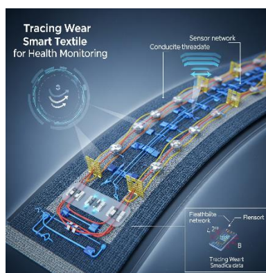
Figure 5. Tracing wear.