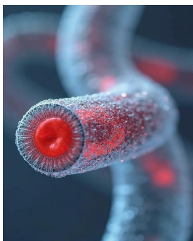
Figure 2. Artificial blood vessel.

ultramodern ski jackets now feature integrated heating and tracking systems. Incipiently, phase change fabric laboriously regulates body temperature, offering adaptive comfort. These inventions demonstrate how smart fabrics are reshaping our diurnal lives and diligence.