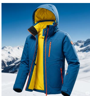
Figure 4. Ski jacket.