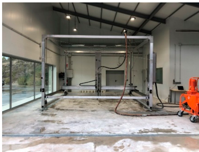
Figure 1. 3DLAB Printer at Cementos La Cruz .

A gantry-based 3DCP system was employed with a nozzle diameter of 25 mm. Four open time intervals (0, 10, 20, and 30 min) were tested. The printing was conducted at 21\pm 1^\circ\text{C} and 50\pm 5\% RH. Each specimen was printed in 5 layers, and the interlayer contact surfaces were neither pre-wetted nor treated.