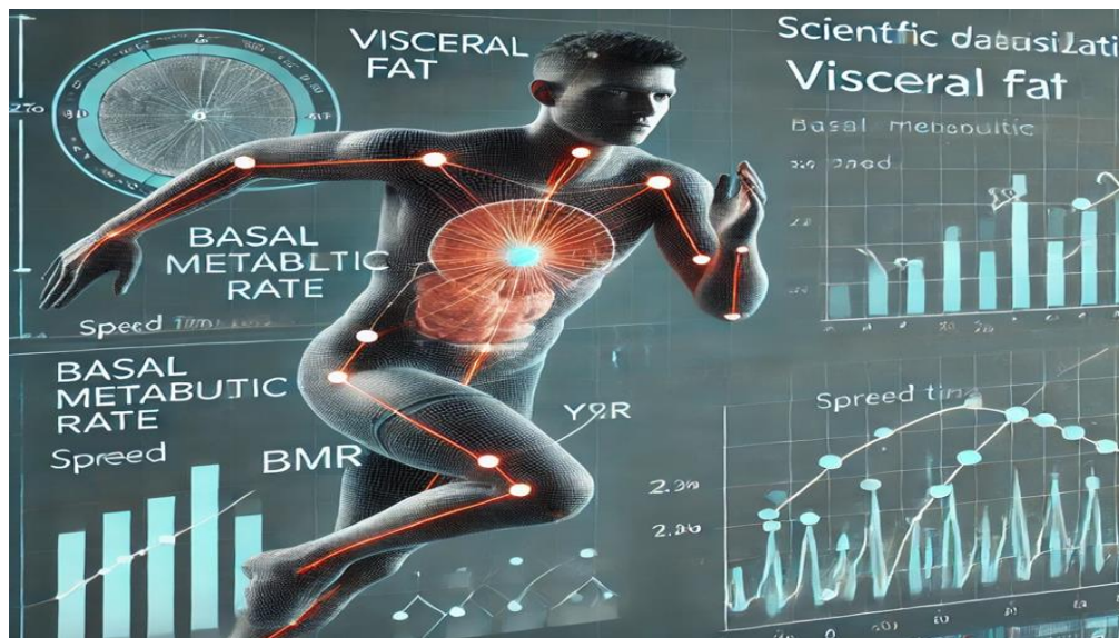
Figure 2. Gender-stratified bar graphs showing interaction effects ( VF \times BMR ) on speed.

Table 5 presents the regression coefficients for Visceral Fat (VF) , Basal Metabolic Rate (BMR) , and their interaction ( VF \times BMR ) in two models: