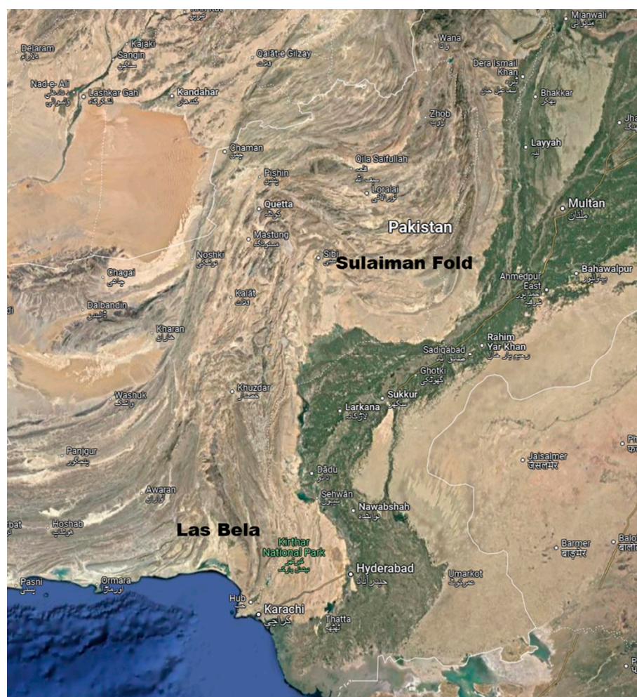
Figure 4. The tectonic activity resulting from the collision of the Indian and Eurasian plates led to the formation of the Sulaiman Fold in the north-western region of the Indian plate. At the junction of Indian and Eurasian plates is the Las Bela triangular plain, encompassing the Miani Hor lagoon. The collision and subsequent interaction between the Indian and Eurasian plates have resulted in complex geological processes that contributed to the formation of the Las Bela plain.

Miani Hor, a coastal lagoon within the Las Bela plain, adds to the area's ecological and geological importance. This lagoon is a vital habitat for diverse marine and bird life and serves as an essential site for local fisheries. The interaction between marine processes and tectonic activity has shaped Miani Hor's coastline, creating a distinctive environment where the land meets the Arabian Sea.