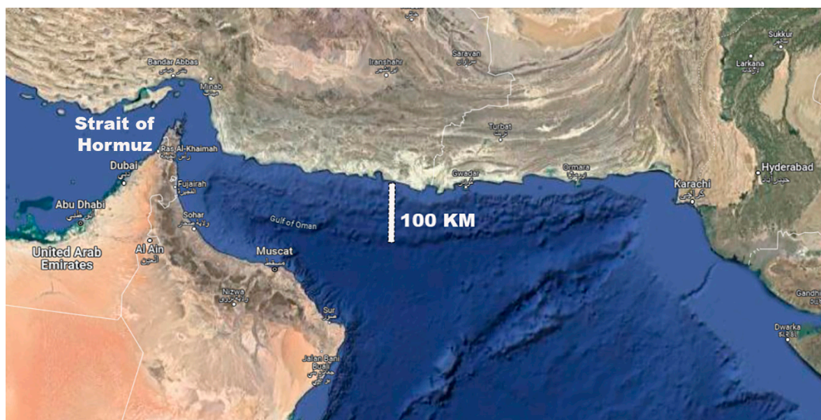
Figure 3. As the Indian plate moved northward it unveiled the continental shelf of South West Asia. Current topographical maps show that the upper continental crust has migrated approximately 100 kilometers due to the movement of the Indian plate. The movement of the Eurasian plate along with the Indian plate fractured the Musandam Mountains thereby forming the Strait of Hormuz.

strait highlights the intricate and dynamic nature of Earth's tectonic processes and their far-reaching impacts on global geography and geopolitics.