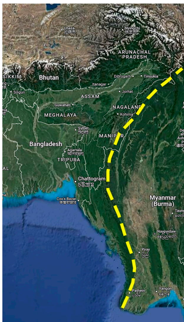
Figure 5. The eastern segment of the Indian plate is distinguished by a notable arc-shaped geological formation (East Indica Mountains) (yellow dotted line). Extending from the Eastern Himalayas, the East Indica Mountains stretch all the way to Cape Negrais in Burma (Myanmar).

The eastern segment of the Indian plate is distinguished by a notable arc-shaped geological formation that we name as the East Indica Mountains. This mountain range, characterized by its lush tropical forests, encompasses several significant subranges, including the Purvanchal Mountains, which are situated in Eastern India. Extending from the Eastern Himalayas, the Eastern Indian Mountains stretch all the way to Cape Negrais in Burma (Myanmar) (Figure 5). This extensive range not only marks the eastern boundary of the Indian plate but also serves as a vital ecological zone, hosting a rich diversity of flora and fauna within its dense tropical forest cover.