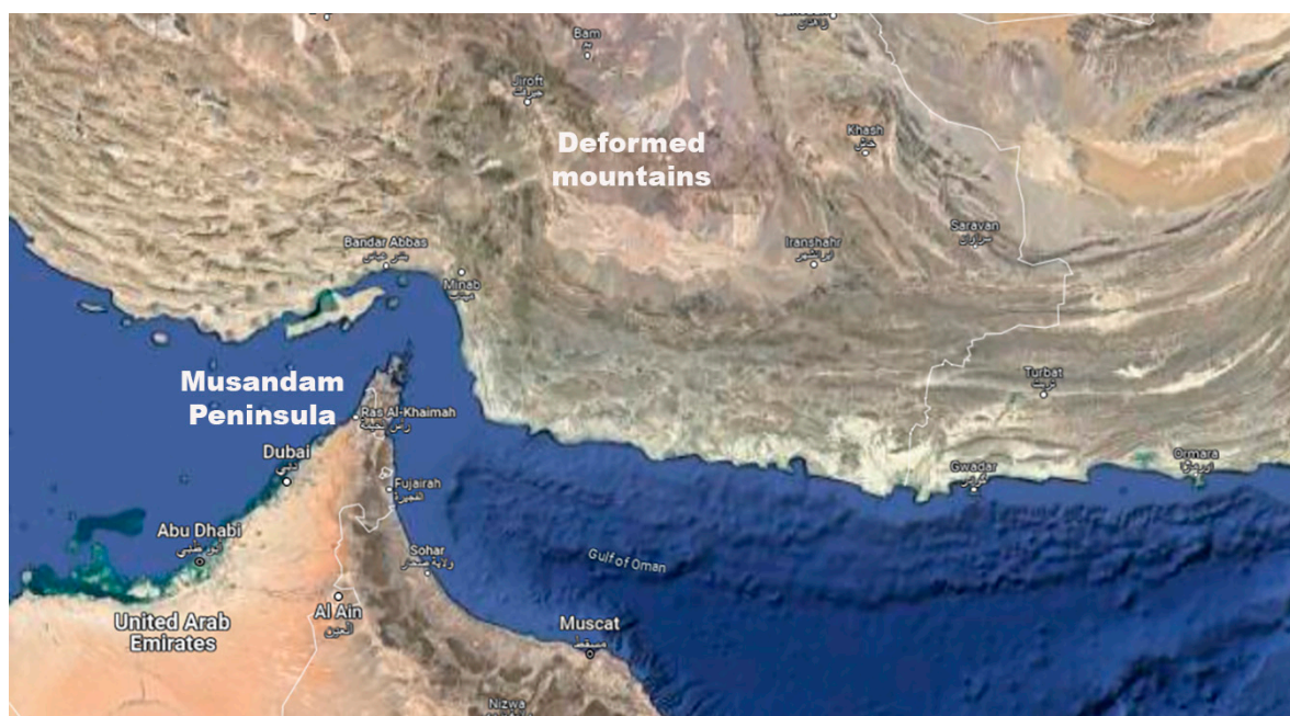
Figure 1. The Musandam Peninsula of the Arabian Plate briefly collided with the mountains of the Eurasian plate forming the Musandam Mountains. The collision of the Musandam Peninsula deformed the Southern Eurasian mountains.

During or prior to the early stages of the Himalayan formation, the Arabian Plate collided with the Eurasian Plate in a significant tectonic event. This interaction was characterized by the subduction of the oceanic portion of the Arabian Plate beneath the Eurasian Plate, resulting in the formation of the Makran Range. The subduction process created intense pressure and deformation, uplifting sedimentary layers and generating the distinct mountainous terrain of the region. Eventually the Musandam Peninsula of Arabia collided with the Makran Range, near the southern Zagros Mountains, giving rise to the Musandam Mountains. These mountains, situated at the northernmost tip of the Arabian Peninsula, are a testament to the dynamic geological processes associated with plate interactions in the region. The Musandam Mountains movement of its northward trajectory led to the formation of a distinct deformity in the adjacent Southern Zagros Mountain range, further shaping the intricate topography of the region. (Figure 1).