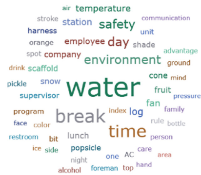
Figure 1. Visual interpretation of participants’ keywords mentioned in relation to their working conditions.

Figure 1 illustrates the most frequently mentioned words from both focus groups and key informant semi-structured interviews. The predominant words were ‘water’ and ‘break’.