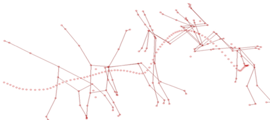
Figure 2. Kinematic structure and COM trajectories in a female gymnast while performing the gymnastic routine of round-off back somersault with stable landing on the balance beam.

Figure 2 shows a kinematic structure of trajectories of COM displacements in a female gymnast while performing the gymnastic routine of round-off back somersault with stable landing on the balance beam.