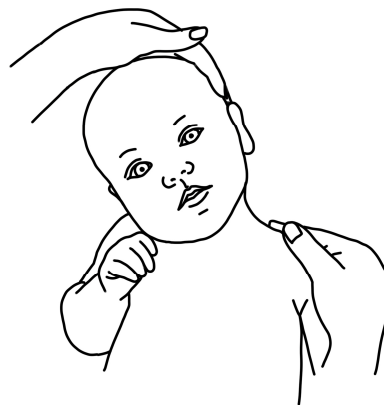
Figure 4. Schematic depiction of supine contralateral cervical lateral flexion manual stretch.