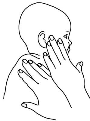
Figure 2. Schematic depiction of left ipsilateral rotation manual stretch.