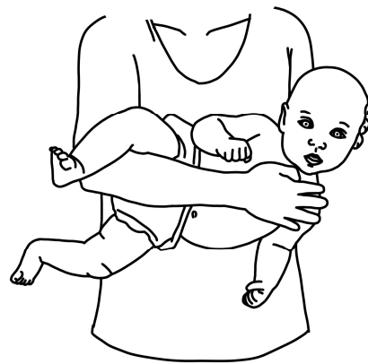
Figure 3. Schematic depiction of “football hold” for contralateral cervical lateral flexion.