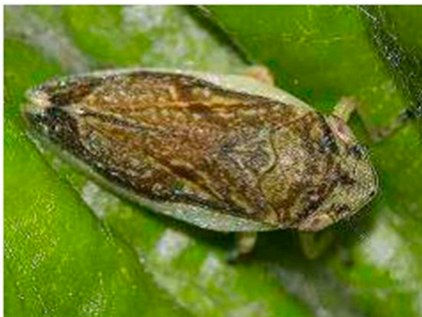
Figure 1. An important vector of X. fastidiosa in Europe - Philaenus spumarius [21].

The potential presence and spread of Xf through seeds have not been extensively studied. However, PCR analysis has detected the bacteria in various parts of the seeds of oranges affected by Citrus variegated chlorosis (CVC) [31]. The researchers suggest that the seed coat may act as a reservoir for the bacteria and potentially contribute to the spread of the disease to new areas. However, Dalla et al. failed to detect Xf in plants obtained from seeds of CVC-affected fruits [32]. Cordeiro et al. also failed to detect Xf in orange seedlings propagated from seeds extracted from fruits with CVC symptoms. In seedlings of six lemon varieties, they also did not detect the bacteria or observed any of the CVC symptoms. Thus, it has been concluded that Xf is unlikely to be transmitted or spread by seeds from fruit of any citrus varieties grown in areas where CVC is endemic [33]. It is worth noting, however, that the studies conducted on the transmission of Xf through seeds were limited to small citrus samples. Therefore, further research is necessary to confirm the potential for transmission via seeds and to determine the actual risk of transmission in the field.