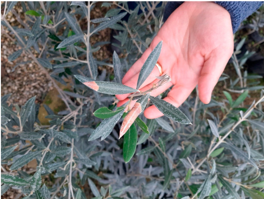
Figure 3. Xylella fastidiosa symptoms in an olive tree (author’s image).

Several important diseases, listed in Table 2, can also be associated with Xf infection, depending on the host and the observed symptomatology.