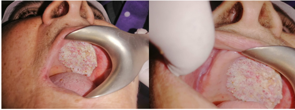
Figure 1. Intraoral views of the lesion.

The computed tomography (CT) scan of the facial bones, with a focus on the hard palate, showed an increase in the left palatal mucosa thickness, cortical irregularity, and osteolysis of the inferior border of the maxillary sinus (Figure 2).