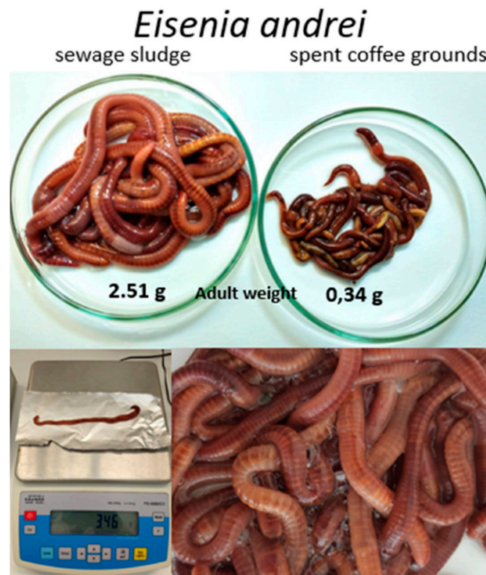
Figure 1. Variation in size and weight of mature individuals of Eisenia andrei fed fresh sewage sludge (2.51 g) (top left) or spent coffee grounds (0.34 g) (top right). Photographs showing a large specimen of Eisenia andrei (3.46 g) (bottom left) and individual specimens of Eisenia andrei collected from the vermireactor supplied with sewage sludge (bottom right).

Gigantic individuals of Eisenia andrei (9.1 g) and Eisenia fetida (7 g) were obtained after being held for 42 weeks at 11°C and fed ox ruminal content (Figure 2). These were the heaviest weights obtained, but 20% of the individuals reached weights of between 5.5 and 6 g. These gigantic specimens displayed notable modifications in their external morphology, including great dilation of the body that began in the segments posterior to the clitellum, with the typical red coloration of this species being maintained only in the segments anterior to the clitellum, with those posteriors to the clitellum being a lighter salmon colour (Figure 2).