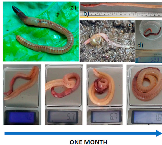
Figure 3. Weight and growth variation of individuals of the earthworm species Dendrobaena hortensis held at room temperature and fed ox ruminal content. Top line: A) External morphology of D. hortensis ; B) Size (length) of the gigantic individuals of D. hortensis ; C) Newly hatched individual of D. hortensis ; D) Specimen of D. hortensis fed on sewage sludge at room temperature. Bottom line: Variation in body weight of D. hortensis during one month: the weight of the earthworms increased by 1 g per week until reaching a final weight of 7.8 g.

The earthworm species Dendrobaena hortensis also reached an extraordinary weight (7.8 g) when held at room temperature and fed ox ruminal content (Figure 3). This species also reached large body weights when fed on fresh sewage sludge, although lower than those fed the ox ruminal content (Figure 3). In both substrates, D. hortensis produced numerous viable cocoons.