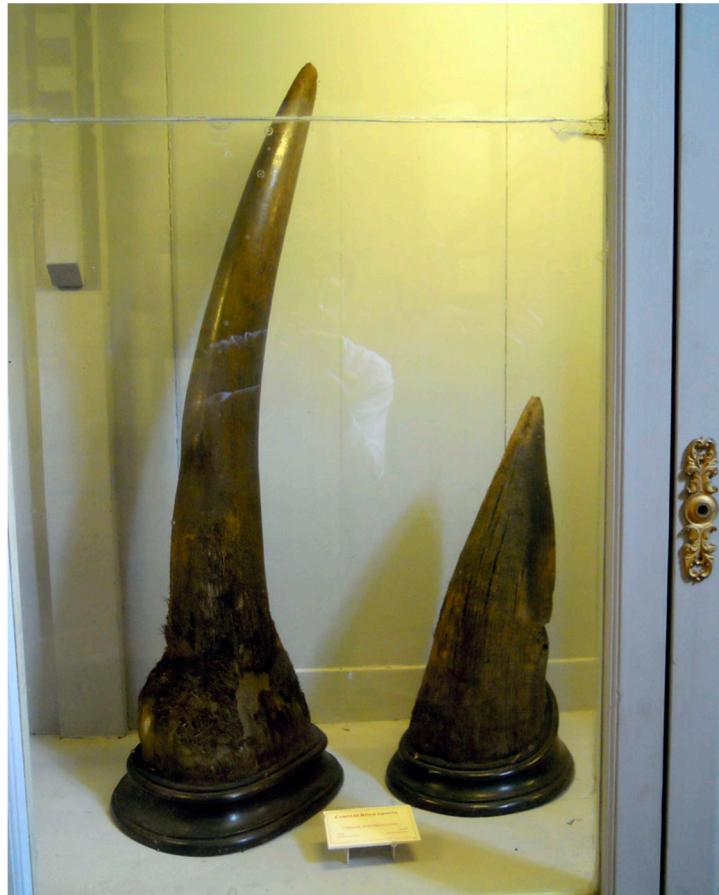
Figure 1. Rhino horns Inventory numbers 8606 and 8607. Size: 1 meter height per 9 kilograms (Inv. n. 8606); ca. 60 centimeters height per 6.5 kilograms (Inv. n. 8607).