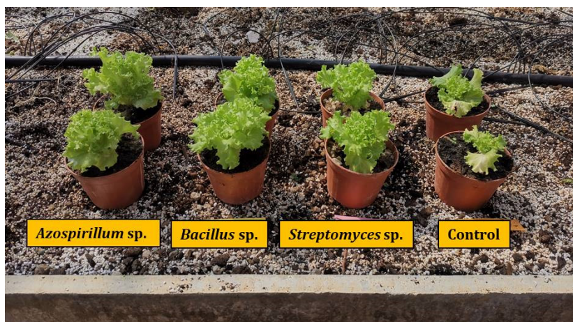
Figure 3. Inoculation of different strains of Azospirillum sp., Bacillus sp. and Streptomyces sp., in the growth promotion of water-stressed lettuce plants.

Using rhizobacteria for drought-tolerant plant growth, researchers led by Melo [122] examined cacti-associated bacteria from semi-arid environments.