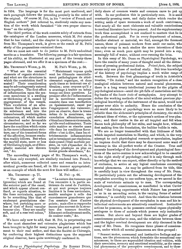
Figure 1. Lancet journal (June 5, 1858) page with the indication of plagiarism [8] (p. 556).

The Lancet magazine and the British scientific community reacted to this case by publishing a three-page article, with the extract of the two articles side-by-side with the image of plagiarism, the plagiarism of the French author, José Pro, being undisputed (Figure 1). The magazine showed that a case of plagiarism, without due credit (citation), can cause immeasurable damage, ending the text of the article with the following expression,