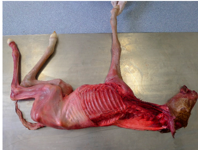
Figure 1. Foal placed in right lateral recumbency with the left forelimb and cervical musculature removed.

thoracic and spinal movement accompanying protraction and retraction of the remaining right forelimb (Figure 1).