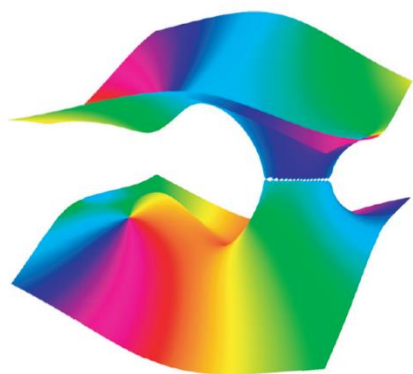
Figure 2: A representation of the (colour-coded) phase of the real part of the eigenvalues of M (Eq.1) calculated in a certain simplification, for chiral dichroic (absorbing) crystals. (Figure 2c of Berry & Dennis [29], reproduced by permission.)