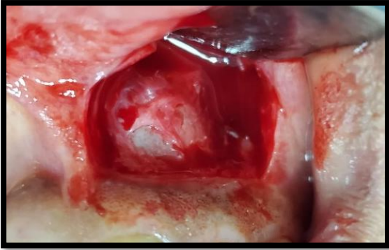
Figure 3 : Perforation of the vestibular cortical