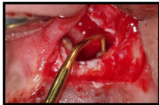
Figure 6 : root-end preparation with ultrasonic tips