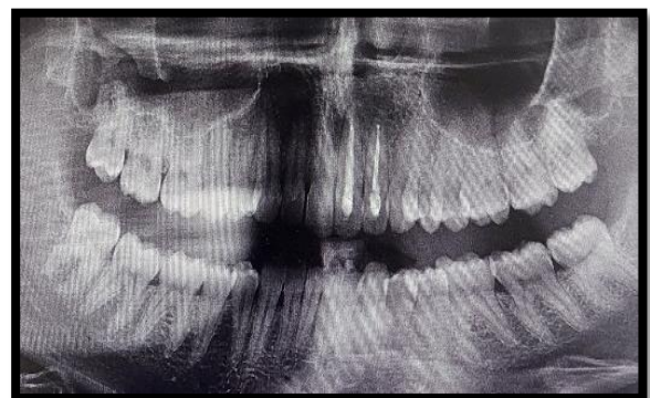
Figure 8 : Radiographic 6 months follow up : reossification of the lesion