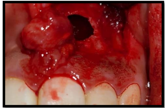
Figure 4 : remove of the whole cyst without membrane separation