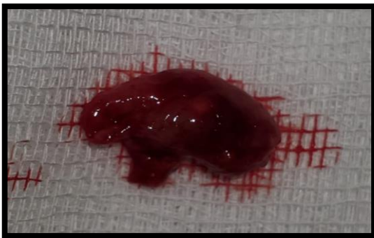
Figure 5 : excised specimen