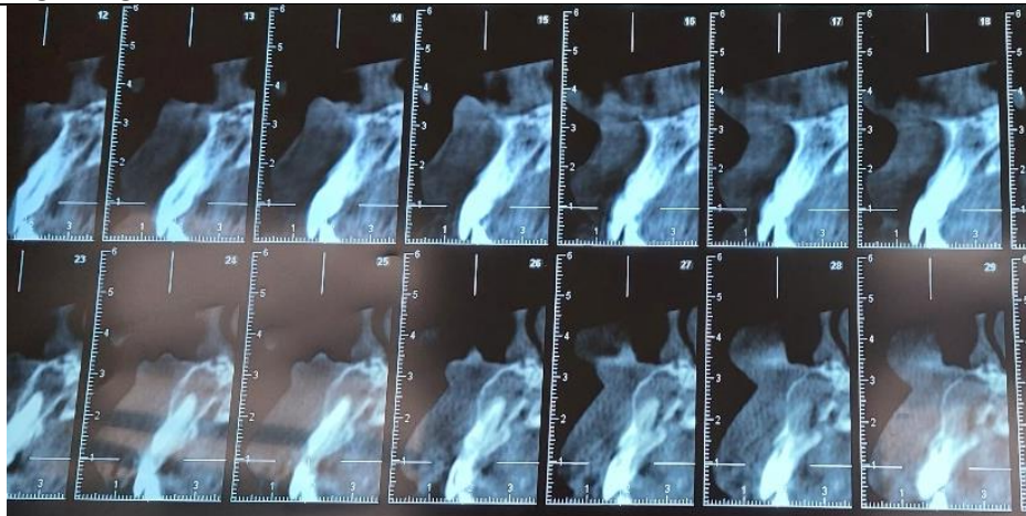
Figure 2 : CBCT investigation : confirmation of initial diagnosis : periapical cyst with bone fenestration