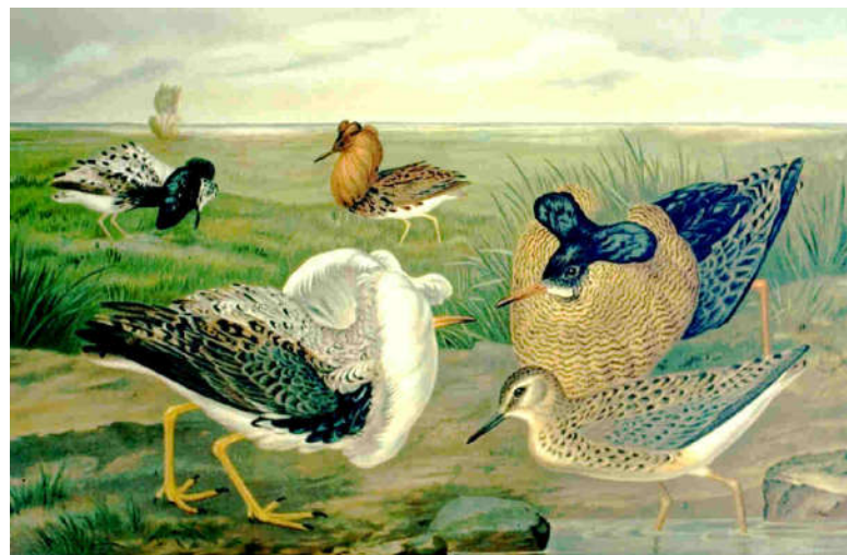
Figure 1. Illustration of ruff plumages: variable darkish males, a whitish male and a female. The dark male in the background adopts the squat posture (see text). Painting by Johann Friedrich Naumann (1780–1857), public domain.

The most conspicuous particularity of ruffs is the polymorphism of male nuptial plumages. These plumages are progressively acquired by a nuptial molt during the spring migration, and lost during a post-breeding molt until mid-autumn [20]. Individual males can be assigned unambiguously to three different categories of nuptial plumages (Figure 1). The “darkish” males may wear a blackish-reddish-bluish ruff of elongated neck-feathers, two tufts on top of their head and a collection of small facial wattles between bill and eyes [21]. The “whitish” males may wear the same ornamentation but their color is here predominantly white [21]. The coloration patterns of individuals are highly variable, making reliable identification possible with human eyes [20-22]. A third category of males does not develop male nuptial plumage. Those males that are similar to females in nuptial plumages were first called “naked-nape males” by Hogan-Warburg [21,23] and then “faeder” by Jukema & Piersma [24]. Males maintain a single nuptial plumage phenotype throughout their adult lifetime [20,21,25]. Female nuptial plumage is only slightly different from their winter plumage, which is also similar to the prenuptial plumage of males [21]. Variation among female nuptial plumage exists in females but is usually too vague to allow individual identification of females [21].