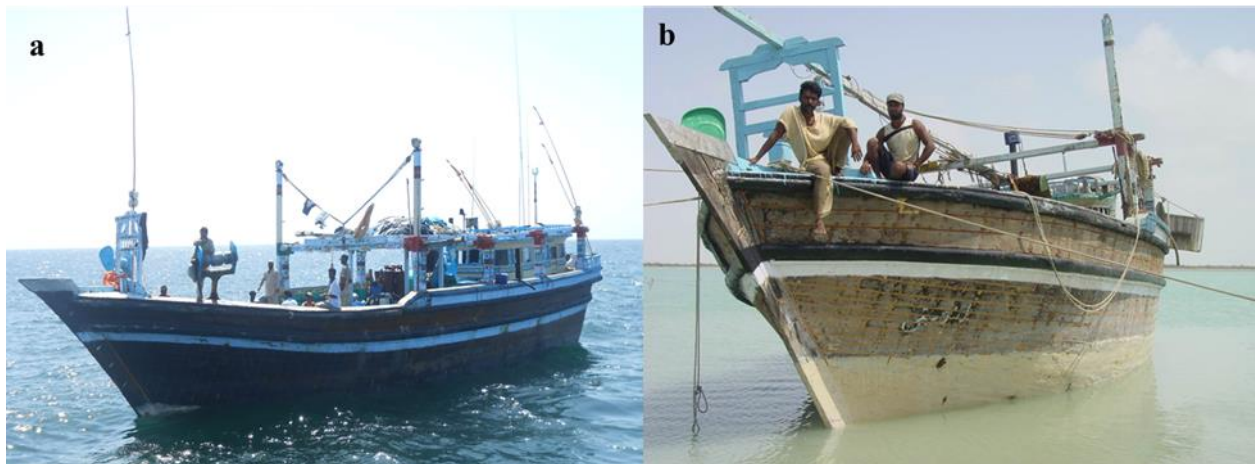
Figure 3 : Pakistani tuna fishing vessels: (a) large (23 m length) fishing boat in open sea, and (b) a smaller boat (12.5 m) beached at Jiwani, Balochistan. (Photo credit: Muhammad Moazzam).

Surface deployed multifilament twisted twine polyamide gillnets with mesh sizes ranging 130-170 mm, with a hanging ratio of 0.5, are commonly used for catching tuna in Pakistan. The lengths of these nets depend on the area of operation, water depth and target species and may vary from 2.4-12 km in inshore and neritic waters and up to 6.0-12.6 km in offshore waters. Infrequently, some boats operating at high seas may even deploy 13-20 km long nets. The depth of the nets is a uniform 14 m, independent of length. Nets are set in the afternoon at around 16:00 for 12 hours and retrieval is started at 04:00.