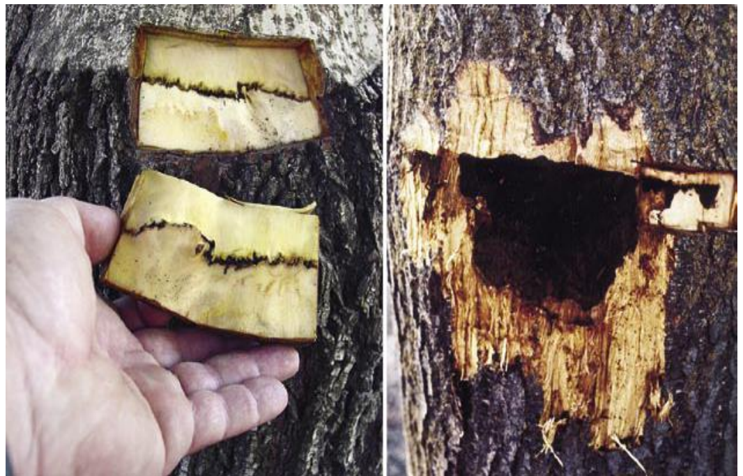
Figure 1. Symptoms of blackline disease in walnut at graft union.

pollen-borne virus enters through flowers during pollination and is systemically transported to the graft union. The resulting hypersensitive reaction of the rootstock and death of tissue at the graft union blocks nutrient and water transport between the rootstock and scion [61]. The hypersensitive response to this virus is controlled by a single dominant gene ( R gene) [240]. To develop CLRV-resistant scion cultivars capable of blocking the virus at the pistillate flower and/or movement toward the graft union, a breeding program was initiated in 1984 the University of California-Davis (UC-Davis) to backcross resistance from Paradox into scion cultivars with commercially acceptable horticultural traits. This program is still ongoing [240]. A DNA marker related to CLRV-resistance that maps to ~6.2 Mb on chromosome 14 has been developed in order to accelerate selection of CLRV-resistant offspring [242-245]. In continuation of work started by E. Germain (INRA-Bordeaux), a hybrid resistant to blackline is in evaluation to be registered in France.