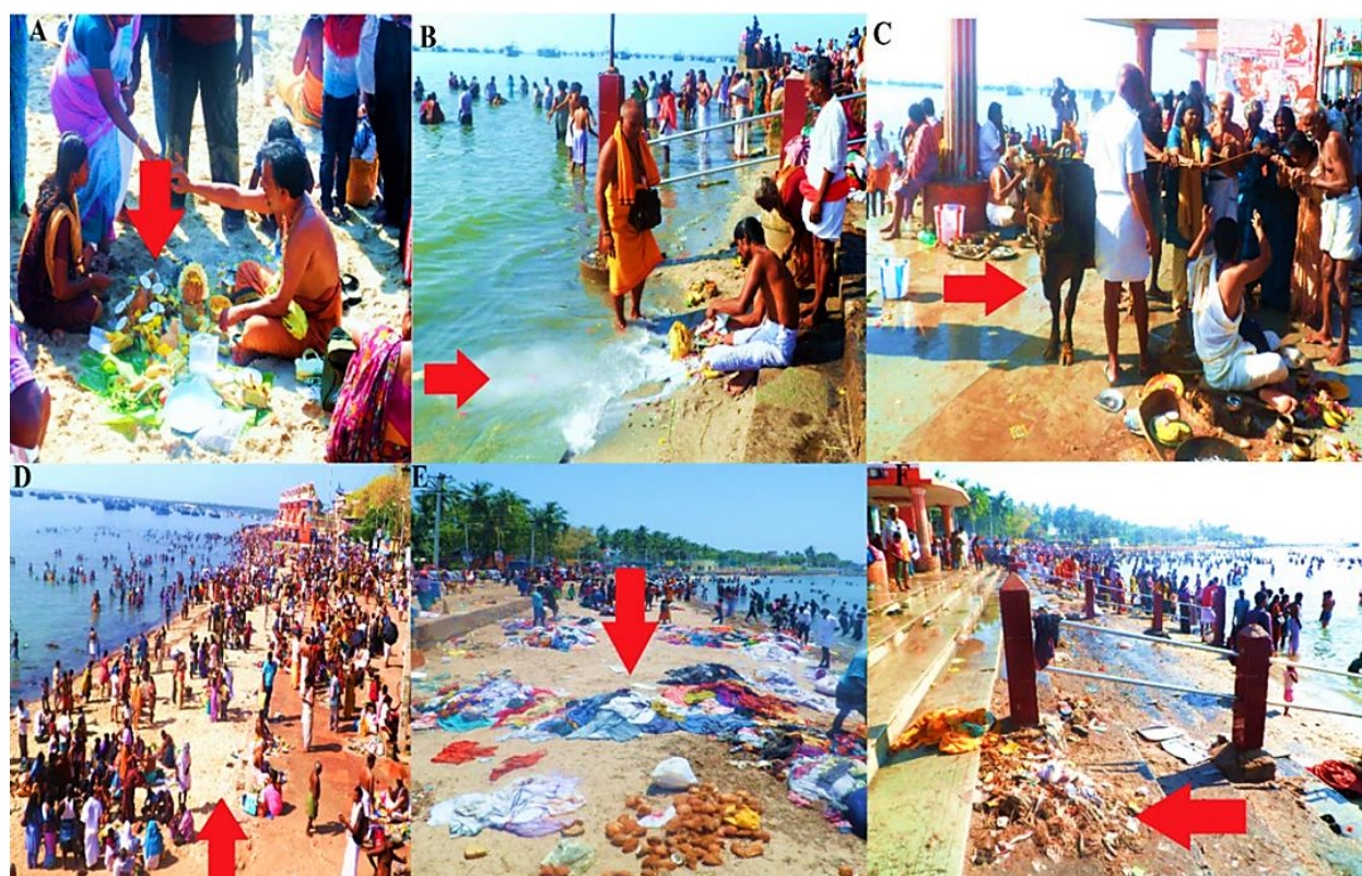
Fig. 2. The photography evidence of the ritual ceremonies impacts in the coastline environment.

permissible limit (SPL) indicator levels of the heterotrophic bacteria ( >61 cfu/ml -3 ) (SPL 100 cfu/ml), total coliform bacteria ( >57 cfu/ml -2 ) (SPL <100 cfu/100) and total Enterococcus bacteria ( >41 cfu/ml -2 ) (SPL 100 CFU/100 mL) in seawater [3,26,30]. Idol immersion increased the heavy metal concentration Cr 0.05 mg/l (SPL 0.1 mg/l), Pb 0.45 mg/l (SPL 0.01 mg/l), Ni 0.17 mg/l (SPL 3 mg/l), Hg 0.78 mg/l (SPL 0.01 mg/l), As 0.5 mg/l (SPL 0.02 mg/l), Si 3.82 mg/l, 0.35 mg/l, Mg 10.0 mg/l and Ca 68.4 mg/l (SPL 75 mg/l), causing serious adverse effects in coastal organisms and affects human health [23,31,32,33,34]. Trampling behavior of millions of people often disturb and destroy seabirds and turtles; affecting nesting and feeding, reducing parental care of highly vulnerable eggs, thereby affecting the biological diversity of the coastline environment [35,36].