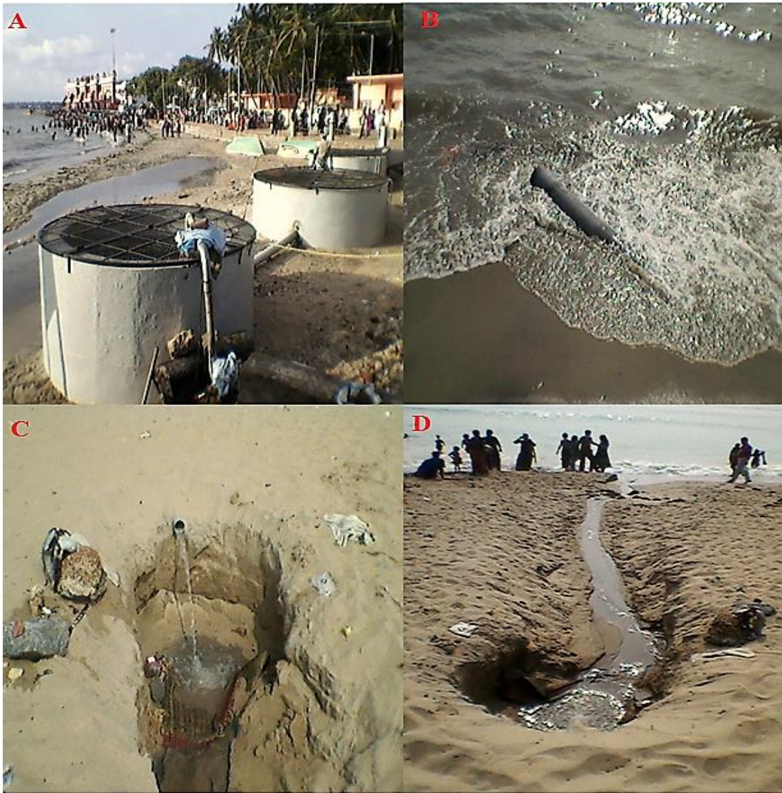
Fig. 3. The photography evidence of the wastewater discharges in the coastline environment.

showed that untreated wastewater released by villages and residential areas surrounding the Sri Ramanatha Swamy temple decreased the 8.9% (32 km 2 ) coral reef system in the Gulf of Mannar marine ecosystem of India [42,43].