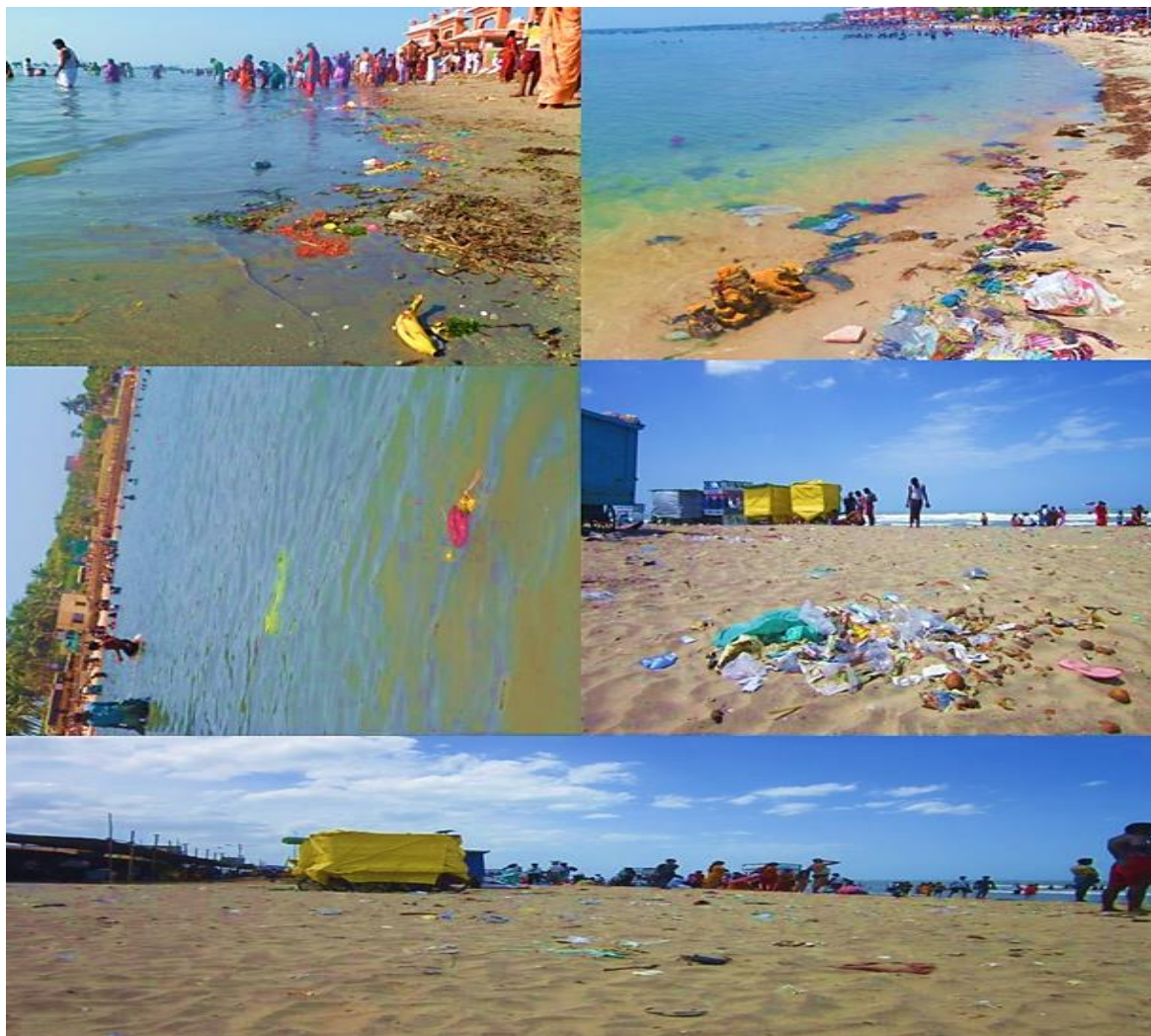
Fig. 4. The photography evidence of the debris pollution in the coastline environment.

through consumption of contaminated seafood can lead to serious adverse effects such as prostate cancer, breast cancer, sperm count decreases, miscarriage, obesity and diabetes testicular dysgenesis syndrome [66,67,68].