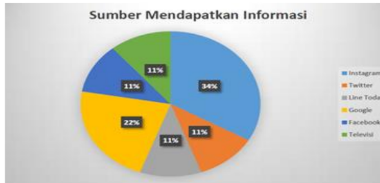
Figure 2. Sources of Information (4)

the latest information from social media; critical millennials are looking for the speed and accuracy of news (4).