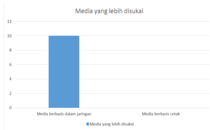
Figure 3. Preferred Media (4)

From the graph above, millennials are more interested in media use information seeking. (4)