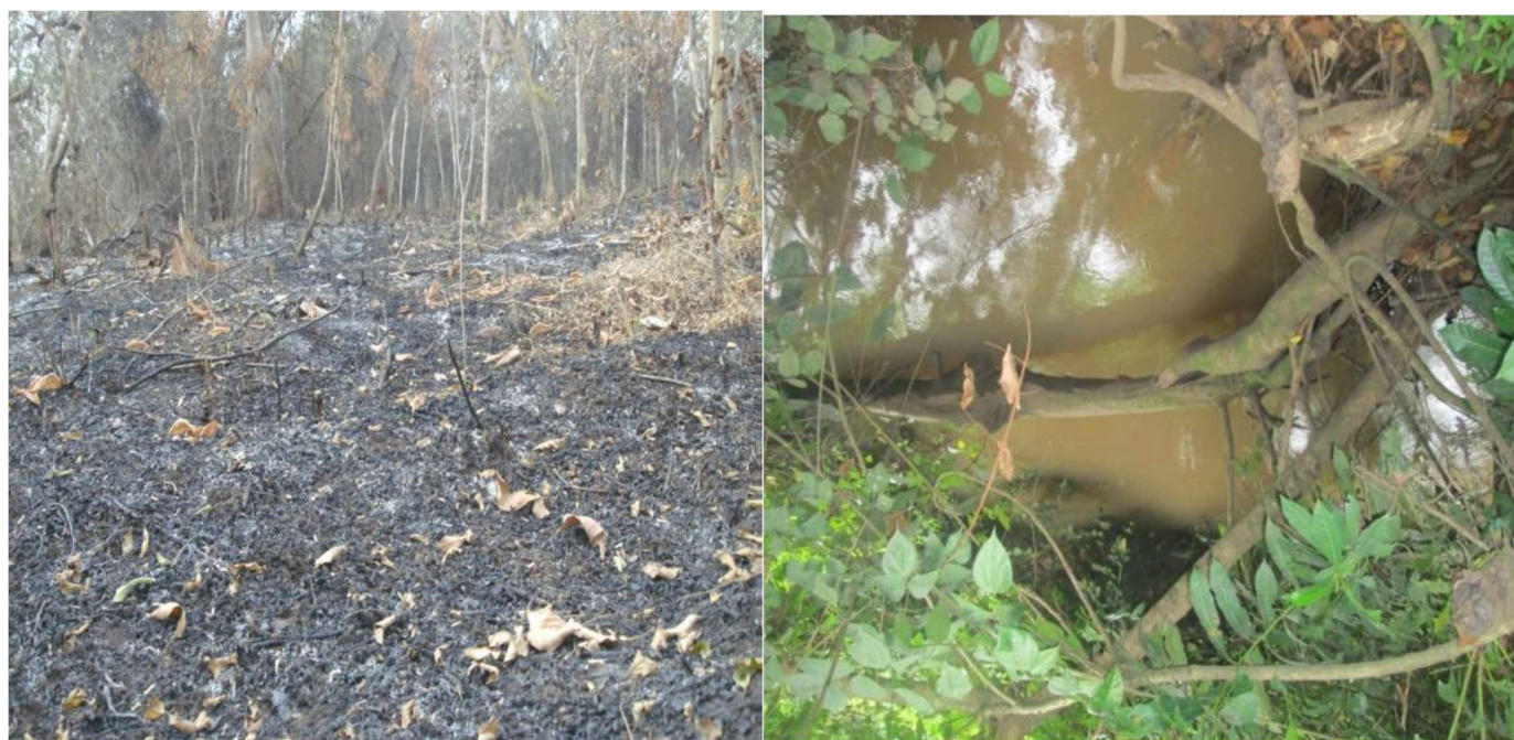
Figure 7. Slash and burn farming and polluted river due to nearby farming activity.