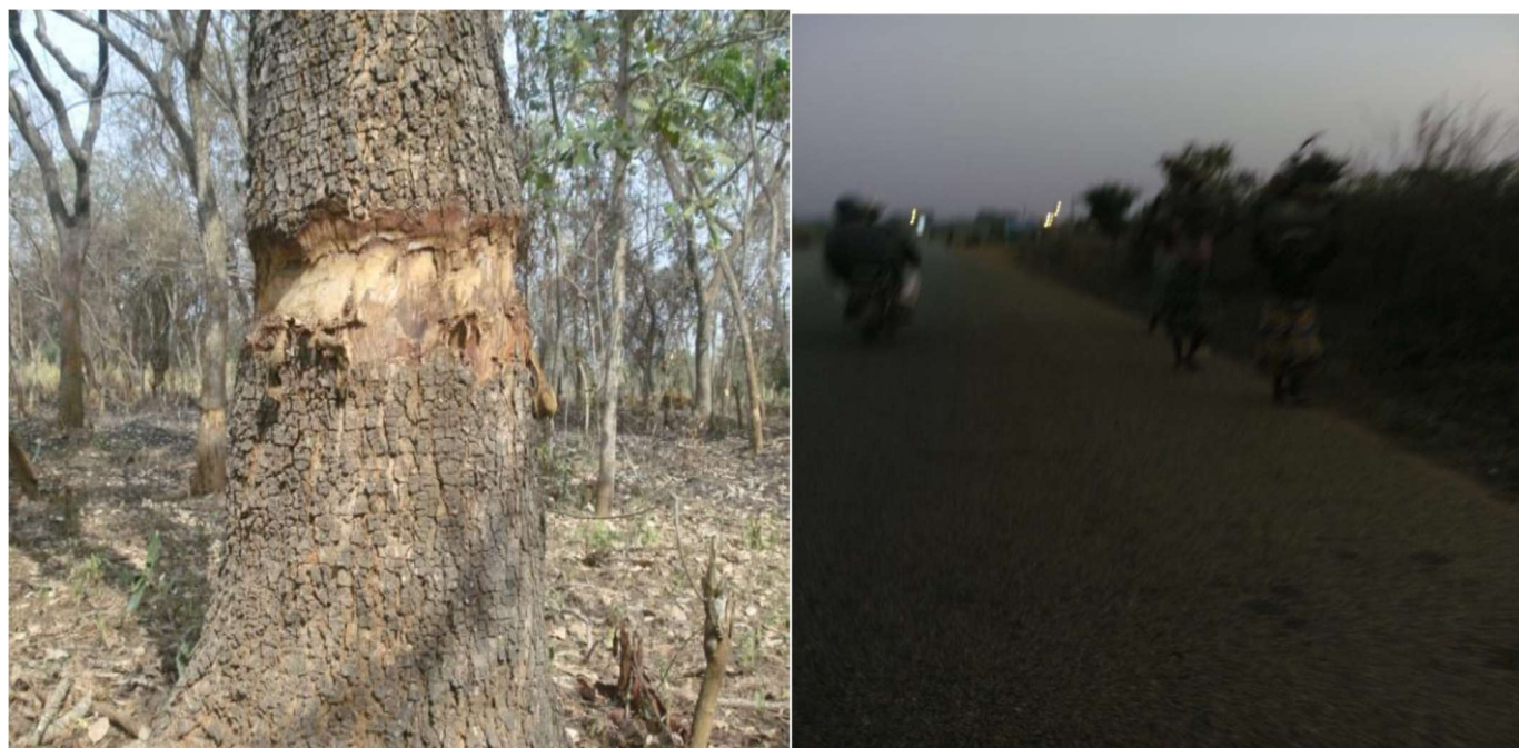
Figure 6. Tree marked to be destroyed by DDT or brine and women carrying firewood to sell at dawn.