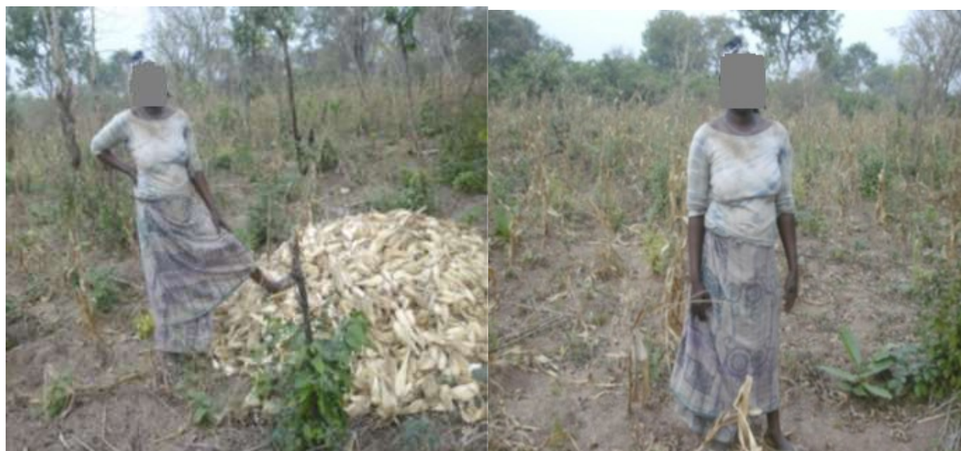
Figure 4. Poor crop yield due to low rainfall.