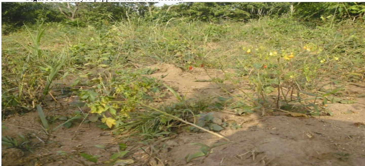
Figure 3. Destroyed pepper farm due to erosion.

These have consequently impacted on their economic lives and their very existence as humans, and is witnessed as: increased poverty levels, threatened food security, increased workload of female farmers such as walking long distances in search for water, poor school performance among their daughters, migration of the men/husbands to cities in search for greener pastures, leading to increased burden of care of children on the women alone.