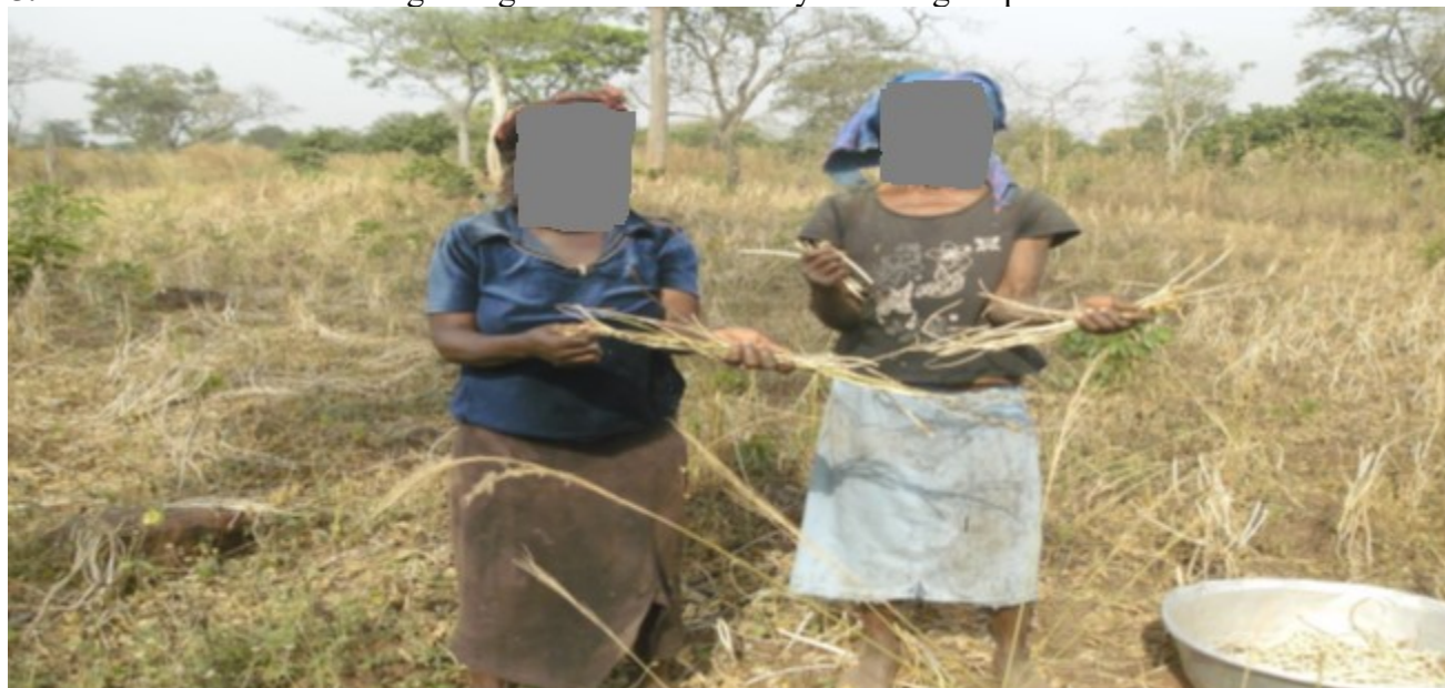
Figure 5. Female farmers harvesting drought-resistant and early maturing crop.