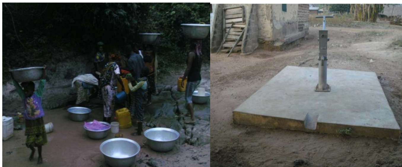
Figure 2. Women and children fetching water from the stream and dried-up borehole.