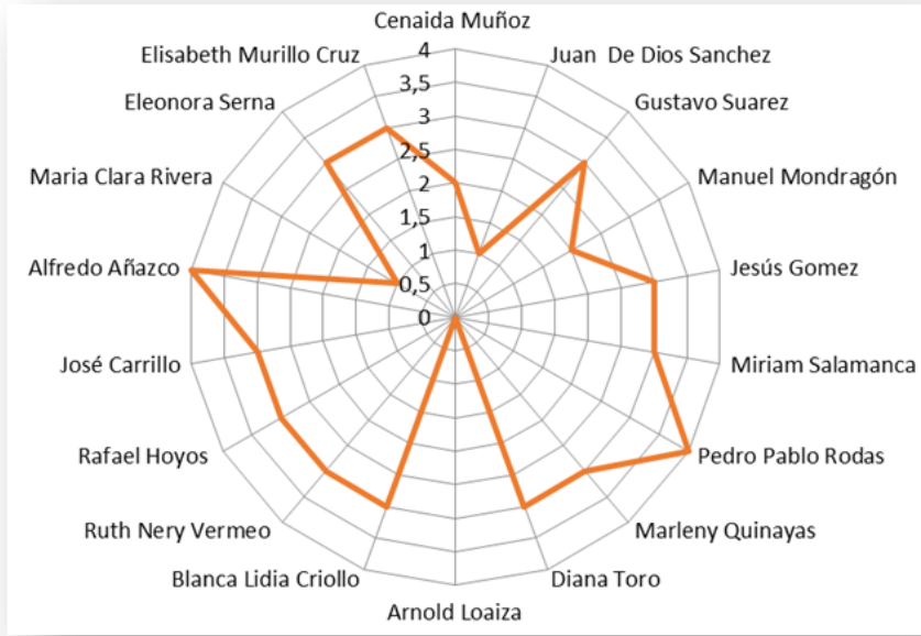
Figure 1. Level of integration of the animal component in the agroecosystem

with diversity of flowers and weeds; in addition to the generation of surpluses for the market. Similarly, families take advantage of the excreta generated by animals to fertilize their crops. The foregoing can be seen in the following graph that shows the integration of the animal component in agroecosystems, there the estimated level is shown from lowest to highest, where the highest rating is 5 and the lowest is 0 (Figure 1).