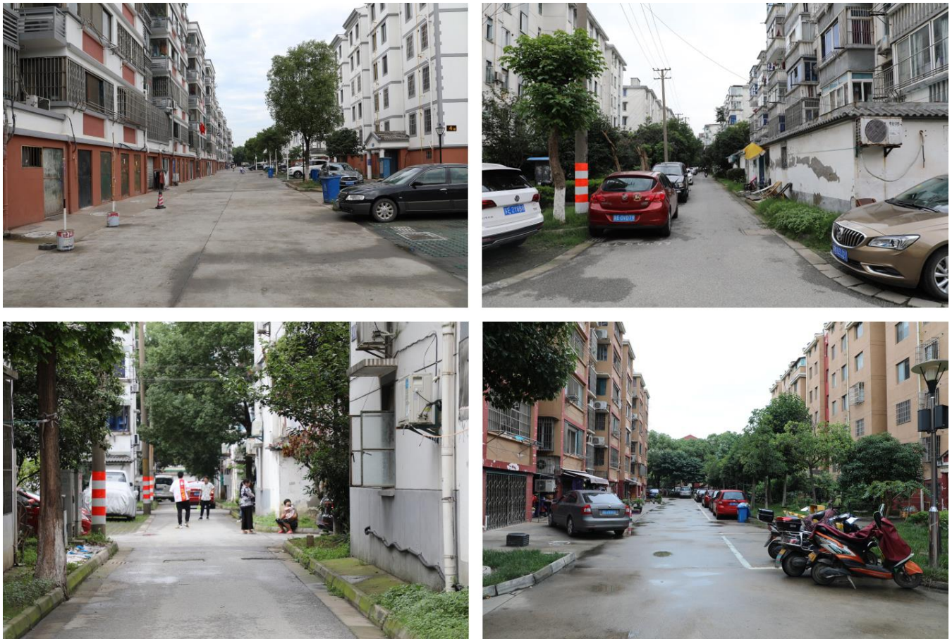
Figure 2. The typical inner courtyards of the resettlement communities.

The analysis of the resettlement communities highlights how some elements and standards are constantly repeated: