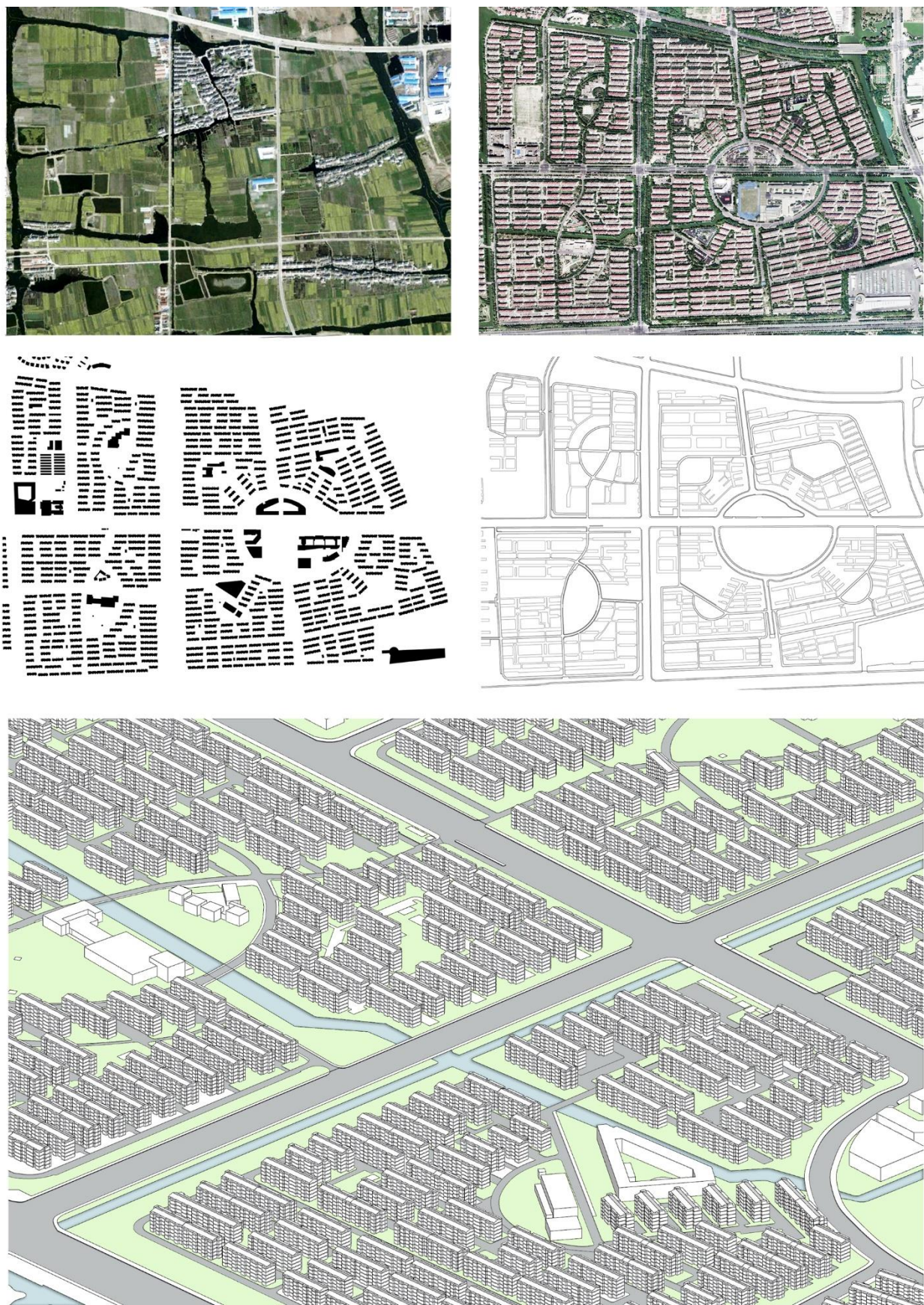
Figure 3. Some representations for the description of the resettlement community Lotus Village, FAR 1.