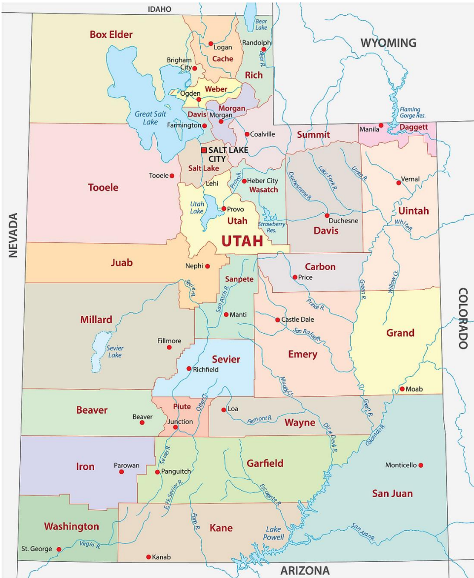
Figure 1. Map of Utah, including names of counties and county seats.

Our metrics of environmental quality come from data compiled in Bowles et al. (1985). This report contains data (and associated methodologies) for four historical measures of GSL dynamics. The four variables of interest, which gauge the presence of arid conditions, include GSL: 1) water level elevation, 2) river inflow, 3) precipitation, and 4) evaporation. These variables are reported annually (either estimated or measured directly, see below) beginning in 1851.