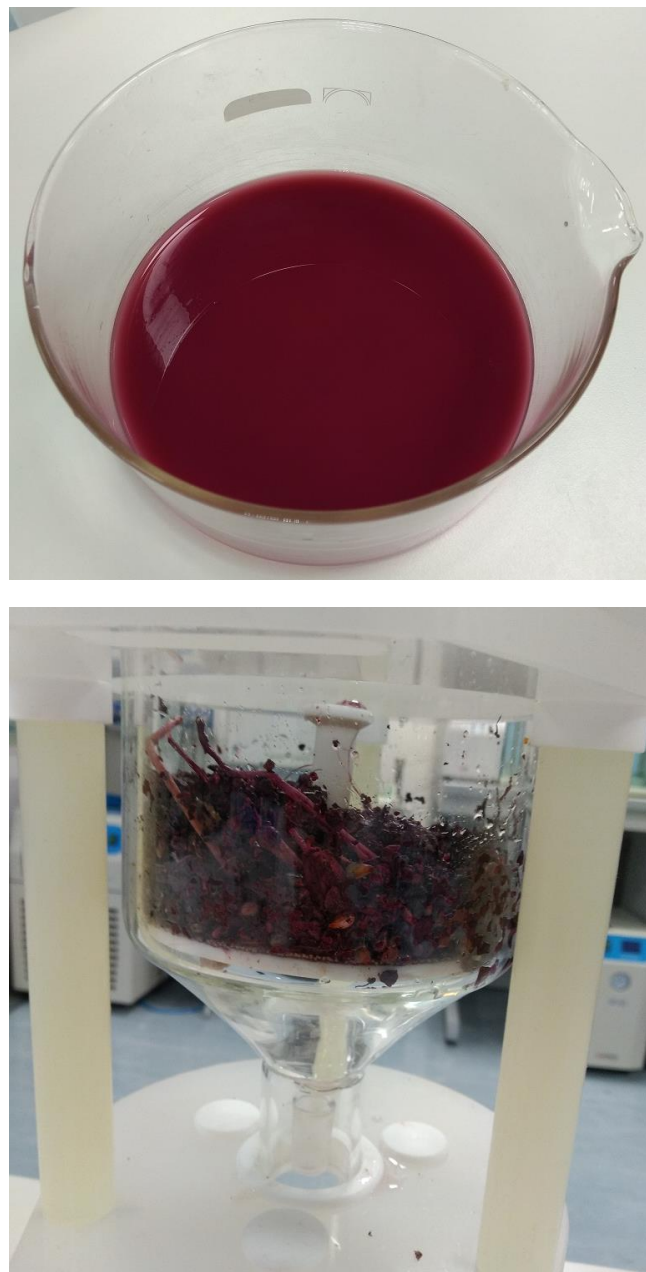
Figure 2. Syrah aqueous extract collected after wine pomace extraction via microwave hydrodiffusion and gravity ( top ) and the residual wine pomace after extraction ( bottom ).

Only the pomace residual of Nero d'Avola winemaking process had a polyphenol content <1000 mg/kg. For simplicity, Table 3 and Table 4 list anthocyanins alone ( i.e. , not amid flavonoids) although anthocyanins are flavonoids with a positive charge at the oxygen atom of the C-ring of basic flavonoid structure.