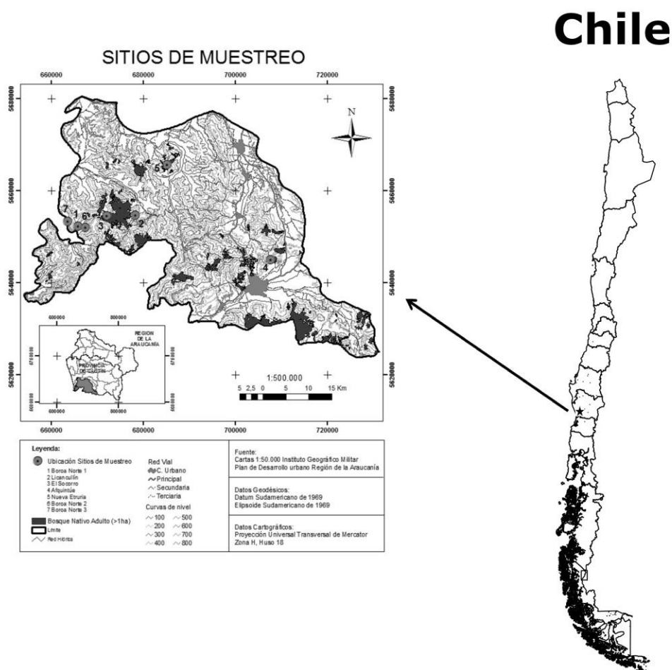
Figure 1 Map of location of the 7 sampling sites, Coastal Mountains, Araucanía Region, southern Chile.