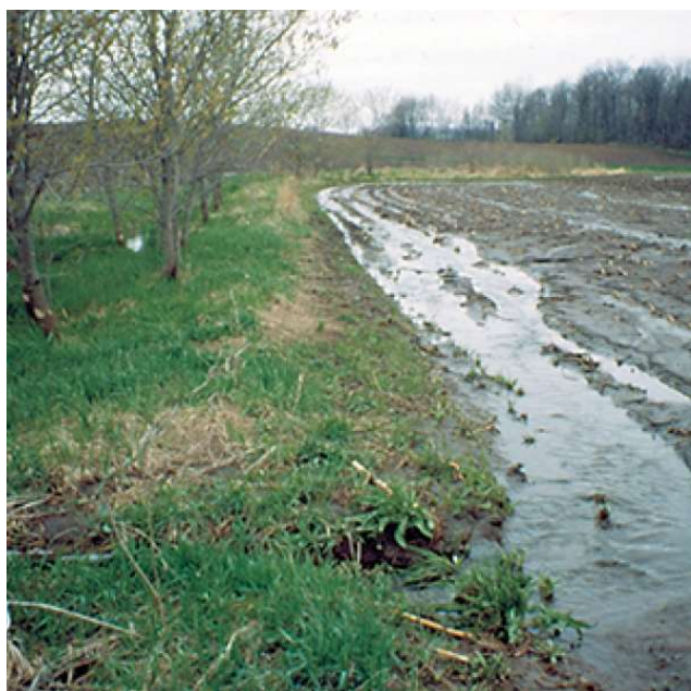
Figure 1. Storm runoff