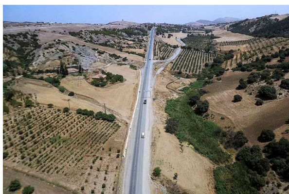
Figure 11. Increasing Algeria’s food security.

The responsible use of policy models requires some level of understanding of their limitations as well as their strengths. Along with presenting the output of their analyses, modelers should make clear the assumptions underlying this output, margins of potential error and possible inconsistencies across different policy objectives. As useful as systems analysis models can be, they are still models, and all models depend on assumptions. The output of some types of models suggest the best policies to select given the assumptions but they don’t identify the best assumptions. Any model of a complex system is a simplification of that system and reflects only a subset of its possible representations. This implies that for any policy modelling exercise, there is a need to understand the information needs of all stakeholders. Knowing this may help determine the needed level of detail in models representing the real world system. But policy making processes are dynamic, and hence their information needs can change. Scientists developing and solving models need to be able to modify and adapt them as needed to meet those changing information needs. Models developed to inform policy makers can be viewed as learning tools to be used to facilitate the dialogue among policy makers, scientists and stakeholders. They can boost the effectiveness, consistency and transparency of policy making processes.