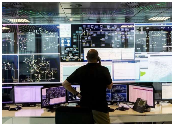
Figure 8. Computer-based decision support system for managing water.

This distinction between the scientific approach to discovery of knowledge and policy making does not make it impossible for scientists and policy makers to work together to better inform the policy making process and indeed the effectiveness of the policies themselves. But it is not always easy, as both scientists and policy makers might prefer to just focus on what they know how to do best, and speak their own jargon without having to learn the other's. The effectiveness of the chosen policies notwithstanding, policy decisions can certainly be made without being informed by scientists or their science. But both know the value of science informed policy making so it is worth making it work as well as it can and in a way that respects the values and concerns of policy makers, as well as of scientists.