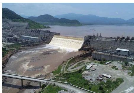
Figure 9. Grand Ethiopian Renaissance Dam on the Blue Nile

While classical scientific approaches cannot solve problems that have no solution, this doesn’t negate the value of scientific evidence that is relevant to those problems. Policy makers can still benefit from considering the analytical scientific evidence pertaining to policies that may favor or constrain them from achieving particular objectives or goals. At the same time policy makers need to reconcile conflicting values and objectives and also ensure that any chosen course of action is politically acceptable, which hopefully means acceptable to a majority, including the public. Good solutions are those that best reconcile all these considerations. Scientists can help with the technical or analytical part, but the rest falls to the policy makers.