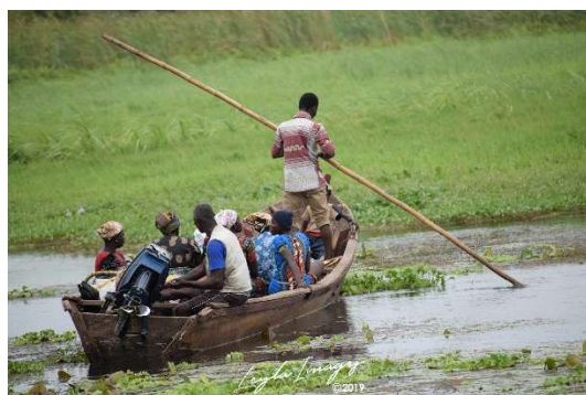
Figure 7. Aquatic Weeds hamper users of the Volta River at Kpong downstream of the Volta Dam.

Policymaking is not, as often assumed, a sequential, stepwise, deterministic process. Both the supply of and demand for scientific knowledge and evidence occur in the policy making process at seemingly random times. External events happen that influence policy makers' goals and constraints. With information and even deliberate disinformation overloads, it can become less clear what information is important and relevant, and when, and what, and who, to trust. Close collaboration among scientists and policymakers helps build and maintain the trust necessary for successful science – policy interactions. It also helps scientists focus on what science is relevant as opposed to what may not be. [22].