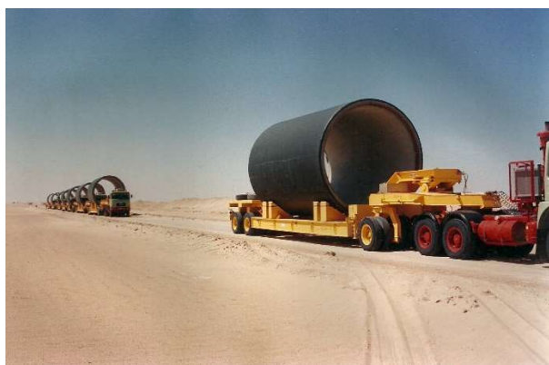
Figure 4. Transporting Pipes of the Great Man-made River in Libya.

Too often the media tends to misrepresent the scientific consensus and focus on dissenting pieces of information, for the sake of a 'balanced approach' or by attracting attention to a conflict of ideas. Deliberate disinformation campaigns that produce false and carefully crafted messages can further confuse stakeholders and degrade the policy making process. [16, 17].