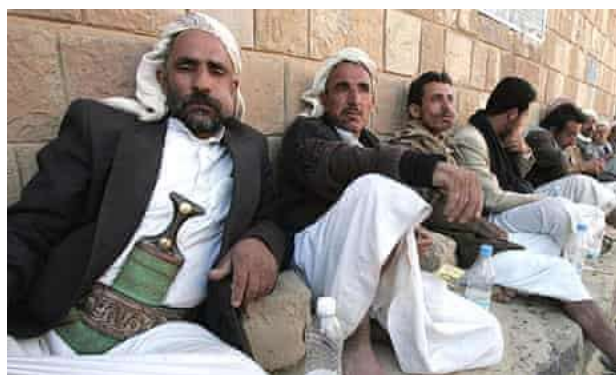
Figure 5. Yemeni men relax in the shade chewing qat, a mild drug used by most Yemenis.

As much as policy makers should consider long-term impacts of their decisions, especially if sustainability is among their objectives, they tend to favor short term goals given the limited time they have to gain the support they need to get re-elected. But decisions made to satisfy short-term objectives will have longer term impacts as well. In the words of Al Gore [19] 'the future whispers while the present shouts' . Debates around issues such as many environmental and water management problems, climate change and social issues illustrate this bias toward the more certain present rather than the more uncertain future. The problems of biodiversity losses, sea level rise or acidification, the destruction of a river delta, and the potential of mass migration and destruction caused by extreme weather events might only be seen in the next decades.