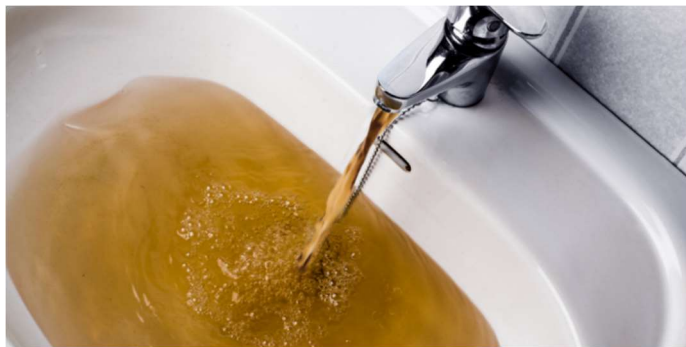
Figure 3. Tap water in a Flint hospital on Oct. 16, 2015.

Example 3. Seven years ago officials looking to save money switched the drinking water supply of Flint, Michigan, in the US, to a new source. Failure to treat the water properly caused lead to leach out from aging pipes into the drinking water of thousands of homes. The economic and health impacts resulting from the high levels of lead, and the legal impacts resulting from the attempt to cover up the crisis and its damaging evidence at all levels of government, are still being felt today. This still ongoing public health crisis highlights an example of environmental injustice and racism. Regretfully it is not the first of such cases in the US nor is it likely to be the last one. Ignoring science, even as it produces inconvenient truths, can be costly, but how much and to whom and when seems to make a difference.