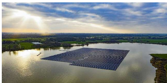
Figure 12. Saving the Mekong with Floating Solar Power.

plan was chosen, the answer was that their chosen plan satisfied other objectives as well. Project objectives and their relative importance can change during a modeling, planning, and policy making process, especially as all involved learn more from the modeling and other sources about what is possible and hence what can be achieved.