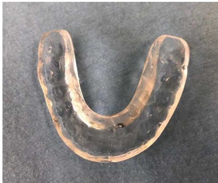
Figure 2. Occlusal splint for the management of TMD and bruxism.

The initial management of TMD may include various medications, such as analgesics, non-steroidal anti-inflammatory drugs (NSAIDs), muscle relaxants, anxiolytics, and anti-depressants. Occlusal appliances of various designs are routinely prescribed, which represent a non-invasive option with minimal risks ( Figure 2 ). The use of occlusal splint therapy has been shown to reduce pain intensity and increase maximal mouth opening [48]. However, whether the effect of occlusal splint is due to placebo effect has been questioned, and that the evidence of its efficacy remains to be low [49,50]. A systematic review in 2018 by Alkhutari et. al. has suggested that the use of occlusal splint may improve patient-centred treatment outcomes, which may be more than merely placebo effect [51]. Multiple designs are available, such as hard, soft, and anterior repositioning splint. At present, there is no consensus on which design is superior, as results from different studies are equivocal in terms of the efficacy of different designs of occlusal splints [50,52].