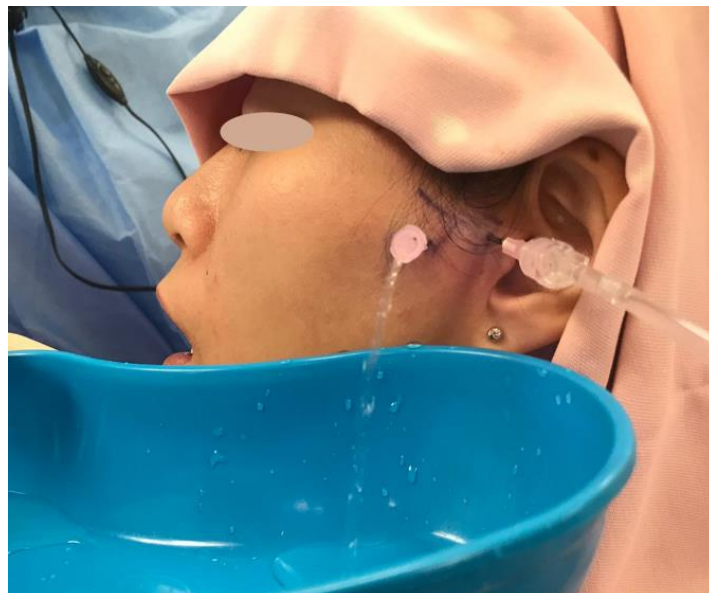
Figure 3. Arthrocentesis performed under local anaesthesia.

Arthroscopy of the TMJ was initially pioneered by the Japanese in the 1970s [68,69], and later popularized by the Americans [70-72]. TMJ arthroscopy may involve lysis and lavage of the superior joint space, as well as operative procedures, such as repositioning of a displaced disc, arthroplasty, and removal of inflamed tissues and adhesions. The efficacy of arthroscopy has since been well-recognized [73-79], and has been found that the therapeutic effect was mainly due to lysis and lavage but not disc position [80]. It was due to this finding that a modification was made, where lysis and lavage was performed without arthroscopic view. This was termed arthrocentesis which was first described by Nitzan et al in 1991 [81], with efficacy that has since been well-documented [46,82-94] ( Figure 3 ).