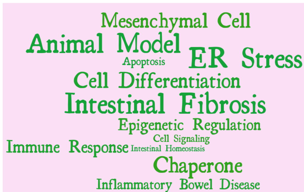
Figure 1: A word cloud of key concepts presented in this review is made by WordItOut online software. https://worditout.com/word-cloud/create

CHOP, C/EBP homologous protein; eIF2 a, a-subunit of eukaryotic translational initiation factor 2; ER, endoplasmic reticulum; ERAD, ER-associated degradation; GRP78, glucose-regulated protein 78 kDa; IBD, inflammatory bowel disease; IRE1, inositol requirement 1; METTL21A, N-lysine methyltransferase 21A; PDI, protein disulfide isomerase; PERK, PRKR-like endoplasmic reticulum kinase; TNF, tumor necrosis factor; UPR, unfolded protein response; XBP1, x-box binding protein 1;