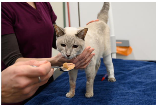
Figure 4. Use of high-value food (or toys) can increase cooperativeness and promotes positive emotions.

Whenever an animal is at the veterinary practice, it should be endeavoured to create positive associations, which can often be achieved easily by the use of food or toys – these should not be limited to the end of the visit but can already be used generously during the examination or treatment, both to distract the animal and to elicit positive emotions [61,62] (Figure 3, Figure 4). For example, animals can lick delicious paste while on the table and receiving an injection, or the owner can offer a handful of treats in quick succession [36].