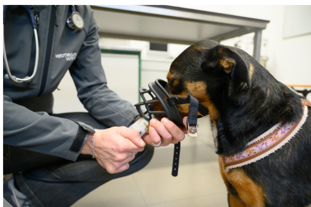
Figure 7. Muzzles increase safety. Food can be used to entice the dog to place its nose into the muzzle and should be offered repeatedly during wearing in order to create positive associations.

Ideally, every dog would have received muzzle training by the owner. For untrained animals that do not need to be fasted, smearing attractive food inside the muzzle is helpful. The muzzle is then offered from below, slipped over the nose and secured as quickly as possible while the dog licks the food inside the muzzle [24,37]. In order to promote a positive association with the muzzle, food should be offered during the entire duration of the procedure [37], e.g. by feeding paste from a tube or a large syringe [7](Figure 7).