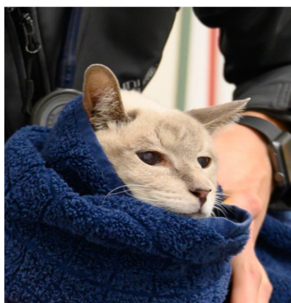
Figure 6. Towels and blankets can be used in various ways for safe restraint of cats and small dogs..

'Cat bags' can be used as a means to restrain cats in similar ways as with towels, but some concerns have been raised that placing the cat into the bag may be difficult and that fitting it too tight might be distressing whereas restraint might not be sufficient with a loose-fitting bag [29]. Thus, using towel techniques was suggested to be preferable for this purpose [29].