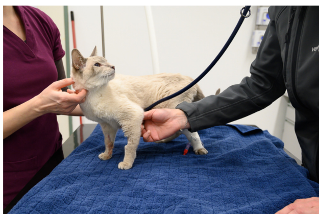
Figure 5. Performing the examination in a position that is most comfortable for the individual and using the minimal amount of fixation needed, improves the patients' compliance and well-being.

The more comfortable an animal feels in its environment and during manipulation, the more likely it is to remain calm and cooperative [37], which not only improves the individual's welfare but also reduces risk to the staff, since forceful handling is one of the contexts associated with an increased likelihood of aggression [3,32,36]. The examination or treatment should therefore be carried out in a position and using a restraint method which causes the least stress to the animal in order to perform the respective intervention lege artis while ensuring the safety of all involved [37](Figure 5). The use of food enhances the animal's cooperativeness so that minimal restraint is often sufficient [42]( Figures 3-4).