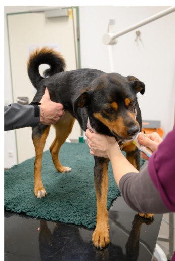
Figure 9. During counterconditioning, a potentially unpleasant or fear-inducing stimulus is paired with a high-value incentive. For optimal results, the start of the potentially aversive stimulus should precede the start of the positive desired stimulus so that it becomes a predictor of something positive. Thus, the ideal sequence of events is as follows: start touch, then start feeding and continue feeding throughout the touch. When you stop touching, also stop feeding.

To achieve this in a veterinary context, the examination and treatment are broken down into small approximations, and each step is immediately followed by a reward, usually food (Figure 9). The approximations are designed so that the animal shows no or hardly any signs of stress, e.g. the examiner might start by moving the hand towards the animal (without touching) followed by a reward and then touching a nonsensitive area followed by a reward. Each further step, such as moving the hand to the target area and gradually increasing time and intensity of the examination, should be followed by a reward. As each step is repeated several times, the animal should become more relaxed – an increase in body tension can be an indication of sensitisation taking place. In the latter case, even smaller steps have to be taken, i.e. the units should be made even shorter or less intense, or other strategies (additional administration of anxiolytic medication) should be used [27,37,38]. Detailed protocols for / counterconditioning in a veterinary context are given in [38].