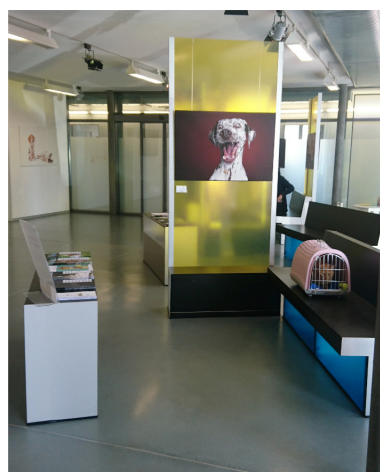
Figure 1. A spacious waiting area with visual barriers is ideal. Due to the layout of the benches, waiting animals do not need to face each other. Cat carriers should be placed on an elevated surface; ideal would be an additional covering of the carrier.

While the examination and treatment represent the most stressful parts of a veterinary visit [3,43], a high percentage of dogs and cats are already fearful in the waiting room [1,2]. Even completely harmless activities, such as weighing on the scale were found to increase signs of stress in 53% of dogs [38]. Many dogs and cats react stressed to the presence of conspecifics or other species both inside and outside of the practice [44,45]. These difficulties are exacerbated if it is not possible to avoid other animals in confined spaces. Thus, the waiting area should be set up to allow maximum distance between animals and should include barriers to reduce visual contact between patients [7](Figure 1). In the waiting room, like throughout the clinic, sound-absorbing tiles, rubberised floors or wall panels and solid doors are recommended to absorb potentially aversive sounds (reviewed in [8]).