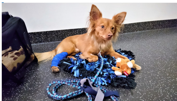
Figure 2. Owners can be advised to bring a blanket from home and to distract the animal with food or toys in order to decrease stress during the waiting time. However, the potential for resource guarding when using toys or chews needs to be considered. Not suitable when sufficient spacing between animals in the waiting area is not possible.

approximately every second dog [49], is more comfortable for dogs if the scale has a non-slip surface, and is not set up in a corner [27,42]. Fear of weighing can be reduced by encouraging and rewarding dogs for stepping on the scale on their own [42]. Easy-to-clean dog beds that insulate from the cold floor can improve dogs' comfort [50], even more so if owners bring their own blanket or dog bed [29,36]. Owners can furthermore bring chews or toys to occupy the dog during the waiting time [27,36](Figure 2).