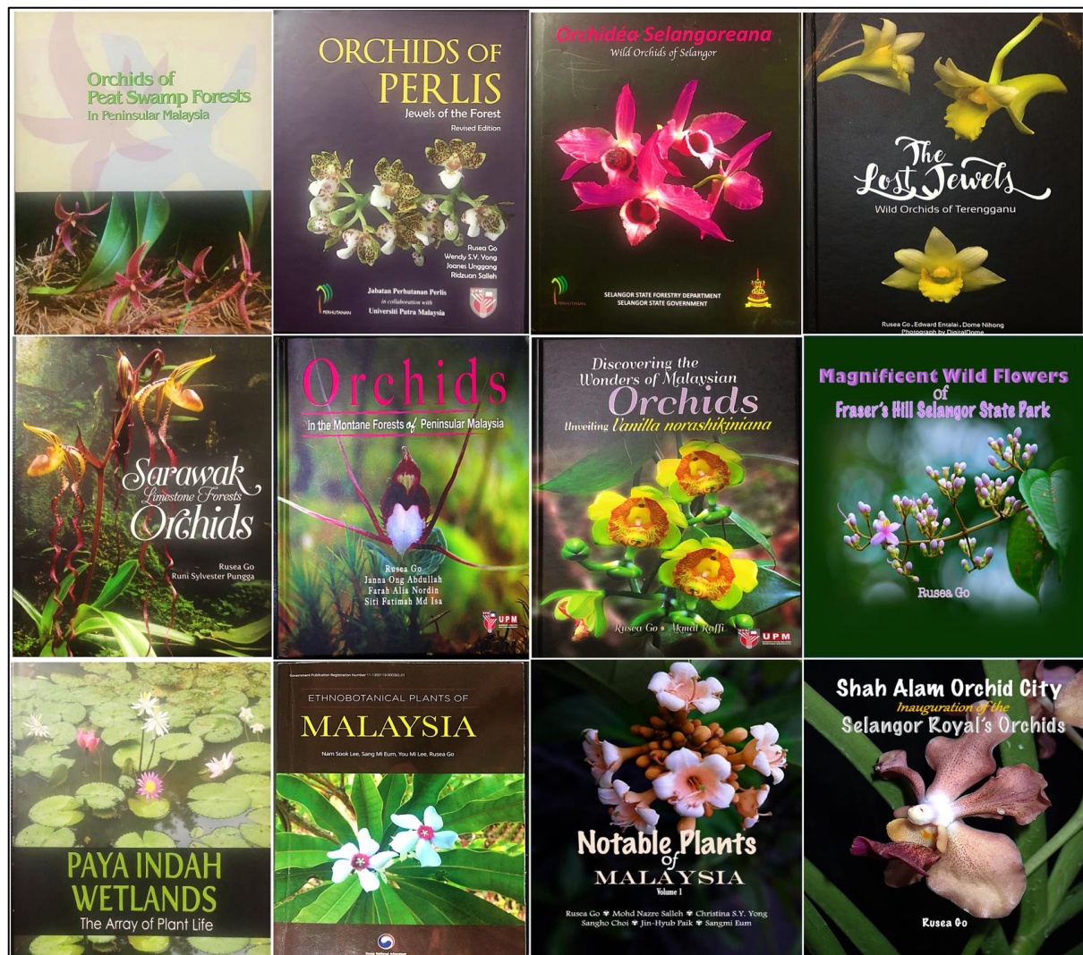
Figure 3: Books on Wild Orchids of Malaysia authored by Go et al. since 2004.