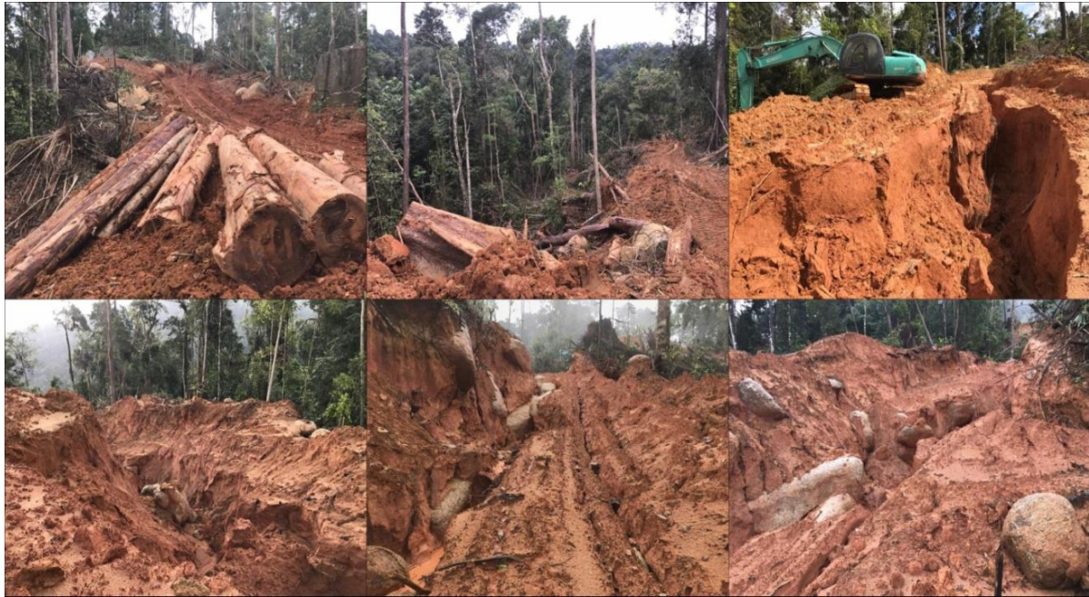
Figure 1: Severe conditions in the logging sites with open canopies, soil erosion and disturbed ground vegetation in Malaysia. These forest areas have been cleared and disturbed for more than three years, based on the surveys and empirical studies carried since November 2016.