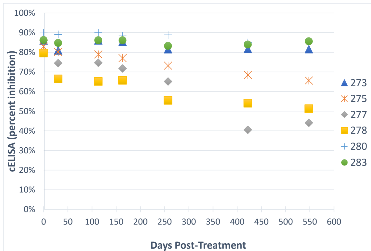
Figure 1. Change in T. equi cELISA values following two courses of imidocarb dipropionate treatment. Day zero is the day of the last dose of the second round of treatment. A horse is considered to be positive by cELISA when the percent inhibition is greater than 40%.