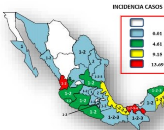
Figure S1.- Identified Serotypes and Incidences of Confirmed Cases by State; Mexico, 2020

Dengue is the next most epidemiologically important disease transmitted by mosquito vectors, with no real estimates of morbidity and mortality, as well as of the economic losses. In Mexico, the main transmitters of dengue are the mosquitoes of the genera and species: Aedes aegypti , and to a lesser extent A. albopictus (the tiger mosquito)(10, 11) infected with the flavovirus serotypes 1 and 2, although 3 and 4 also exist in some parts of the country (Fig. 1). Dengue symptoms are characterized by severe muscle aches, fever with a long period of convalescence, which drastically reduce the effective hours of work, in acute cases of dengue, such as hemorrhagic fever, it can cause hypovolemic shock and even death if medical attention is not provided timely to the patient(12).