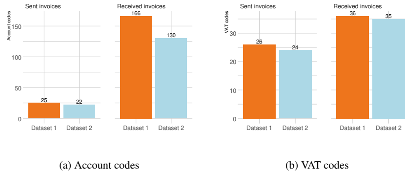
Fig. 1: Number of distinct codes used for sent and received invoices in the two datasets analyzed