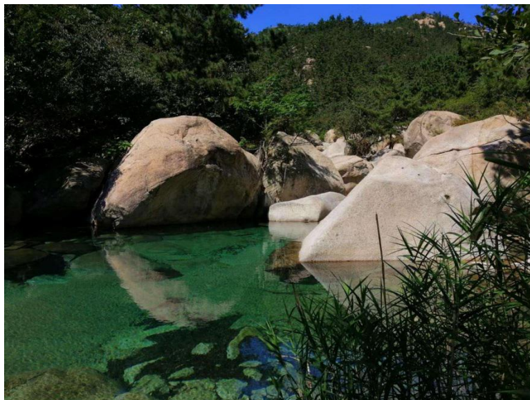
Figure 2. A picture of a pond under sunshine with spontaneous thermodynamic changes. As per the formula of Gibbs free energy, under sunshine, stones shall spontaneously increase their temperature, and water shall spontaneously evaporate, and carbon-based entities (CBEs) in the plants shall spontaneously form into higher-hierarchy CBEs, including synthesis of glucose, cellulose, proteins, and nucleic acids.

force of evolution which has driven the evolution of CBEs for billions of years. The driving force is also providing energy for growth and evolution of all the current organisms on Earth, as simplified by the example given in Figure 2 . This is not a hypothesis, but a conclusion deduced from thermodynamics. It can be seen from the fact that there are more organisms in tropical rainforests than in frozen areas, because the driving force is stronger in tropical rainforests, with the T value in the formula of Gibbs free energy, \Delta G = \Delta H - T \times \Delta S , higher in tropical rainforests, making \Delta G further less than 0 (suggesting the change is more spontaneous).