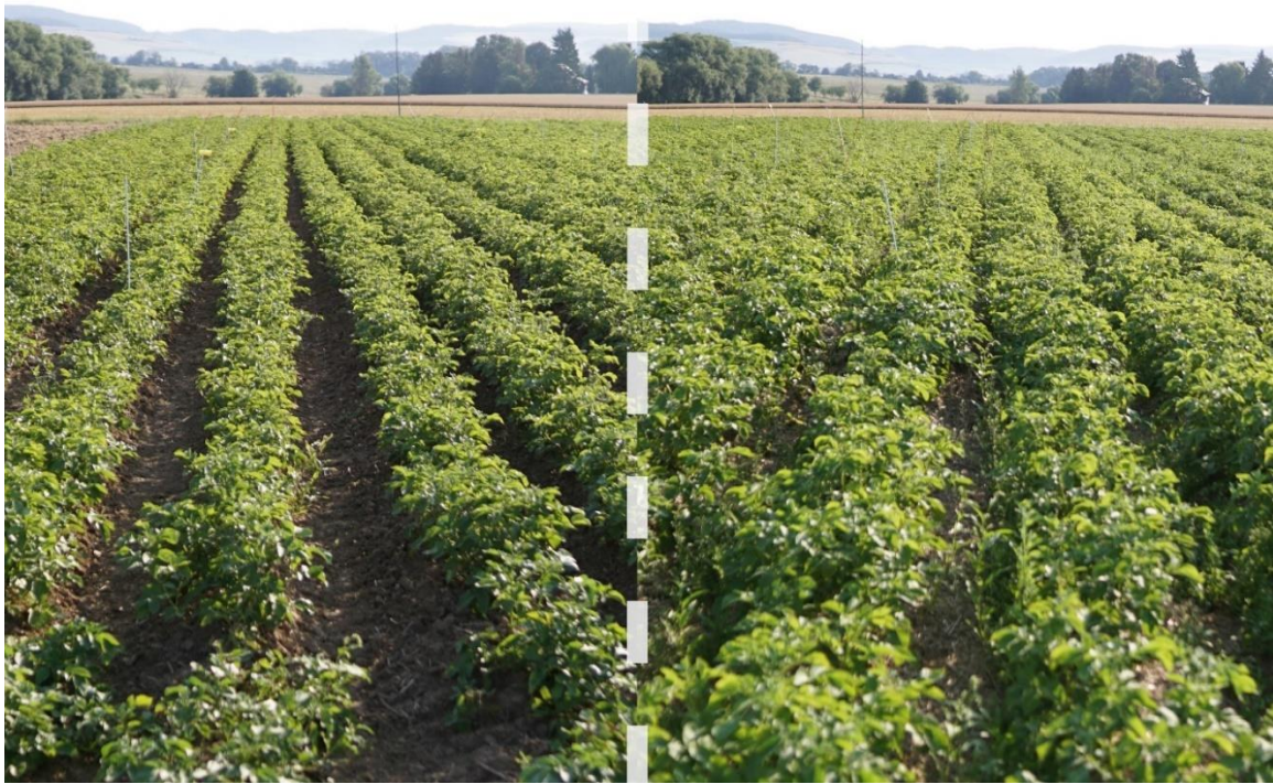
Figure 1. Differences in potato canopy closure on July 24th 2019 prior to flowering (BBCH 59) due to variation in soil fertility. Left: Plough tillage without mulch; right: Minimum tillage with mulch. Potatoes were planted end of May.