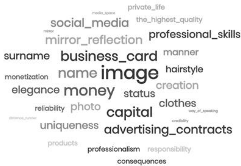
Figure 1. Personal brand in the opinion of respondents – word cloud

When building a personal brand, it should be remembered that each person has their own functional elements – mainly demographic, but also related to skills, experience, qualifications, and declared attitudes. The research shows that personal brand consists of such factors as: appearance (e.g. hairstyle), silhouette, dress or condition of outfit, external traits of character, body language (way of being, gestures), experience or qualifications of a famous person, represented attitude, self-confidence, self-respect, and the ability to gain trust. According to the respondents, the style of communication, the way of speaking, the way of writing (including the way of writing posts in social media), the ability to listen, the way of presenting oneself are also very important. In the opinion of a significant proportion of respondents, personal brand will not be complete without effort being made to analyse and combine all these aspects. In other words, the elements listed by the interviewees should be linked to one another and need to cooperate in symbiosis. If only some of them are developed but the rest is neglected, the personal brand will be incomplete and inconsistent.