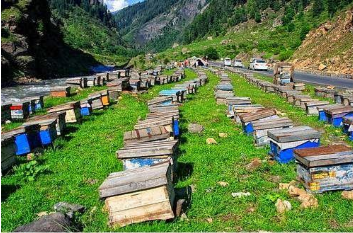
Figure 6: A stunning view of honey bee farm in Pakistan