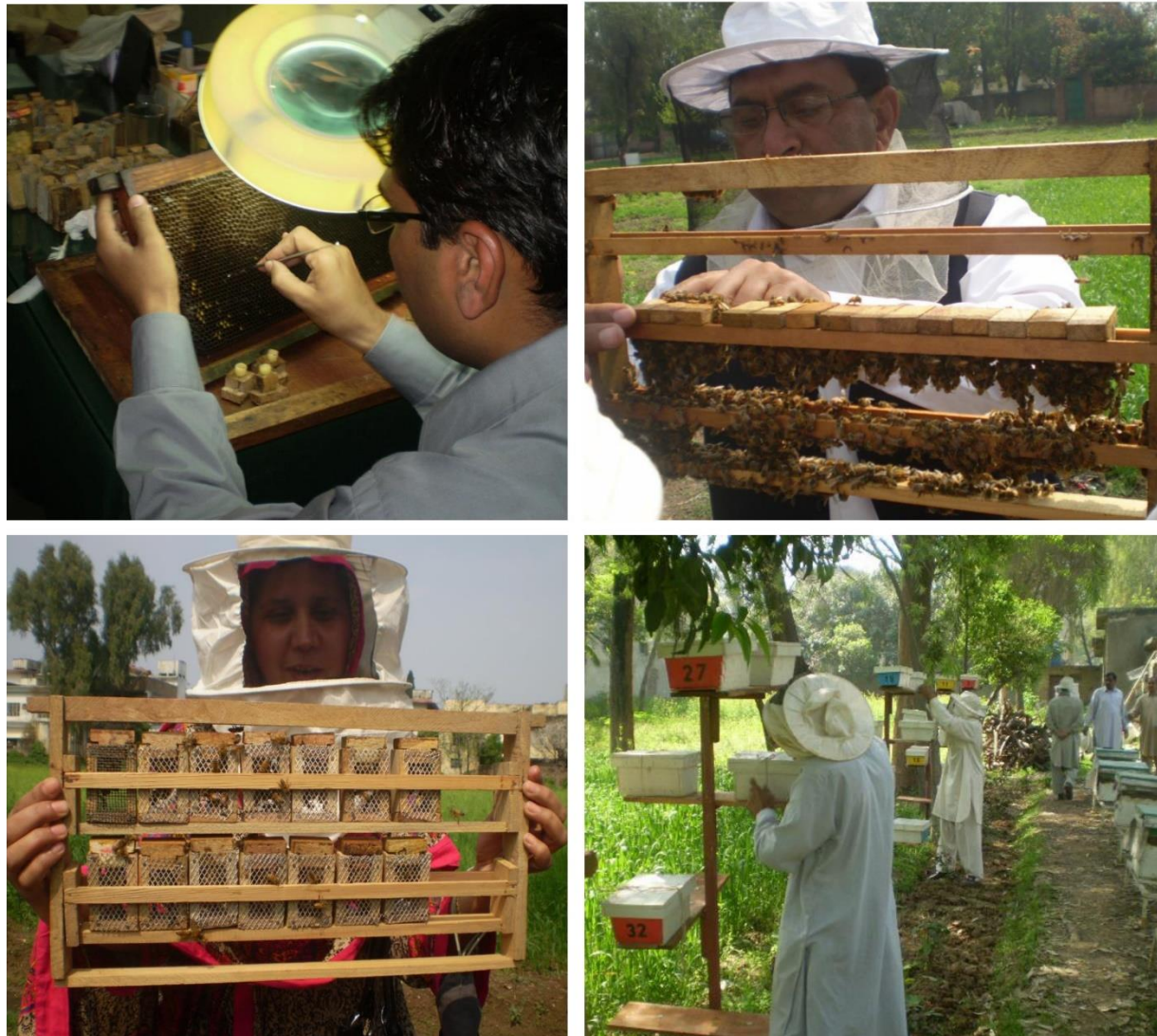
Figure 9: Honey bee queen rearing training course at Beekeeping Research Station, Rawalpindi, Pakistan.

together with northern areas, federally administered tribal area (FATA), and Azad Jammu and Kashmir (AJK). By the development of beekeeping practices in the country, large numbers of people are receiving self-employment as commercial beekeepers and improving their livelihoods.