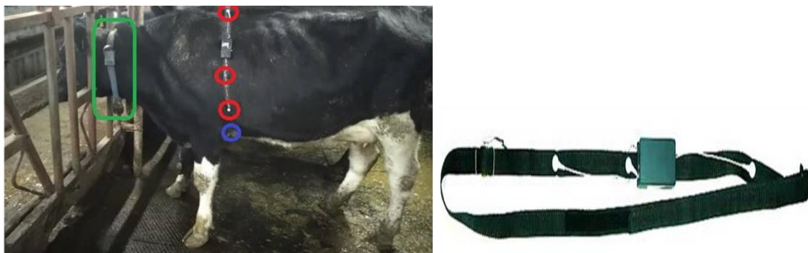
Figure 3. The sensor electrodes were placed on the cow at the gogo, on the left side of the abdominal wall.

After cleaning, the sensor was placed. The sensor electrodes were positioned on the left side of the body. The negative electrode was placed on the left side of the animal behind the caudal portion of the blade, the positive electrode was placed on the left side of the body at the armpit or sternum, and the ground electrode was placed on the left side of the body just below the gogo area. The ground electrode can be placed anywhere on the body, but for optimal belt configuration, the gogo area was selected. All of these electrodes were mounted on a belt and formed a line.