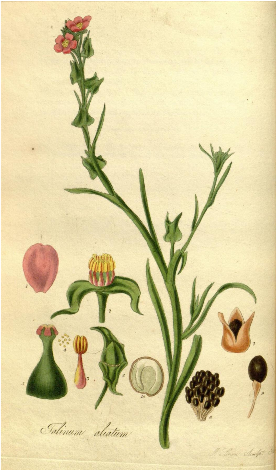
Fig. 1. Epitype of Calandrinia pilosiuscula DC. From Hooker (1824: 82).